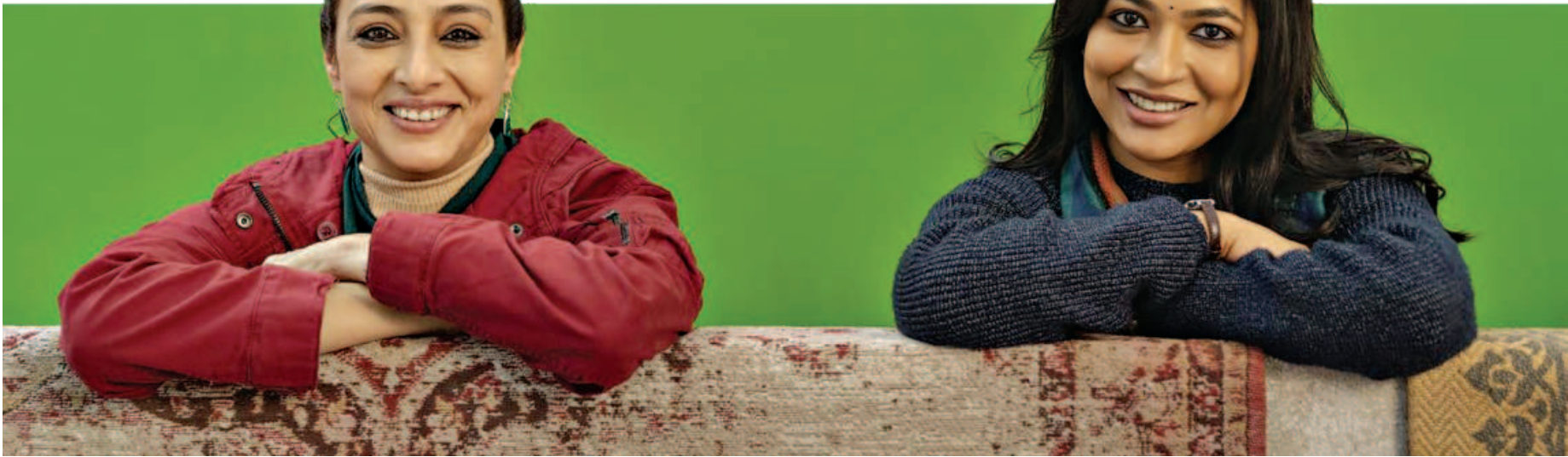
Badhan, despite being cast opposite a veteran like Tabu, held her ground and came up with a stellar performance.