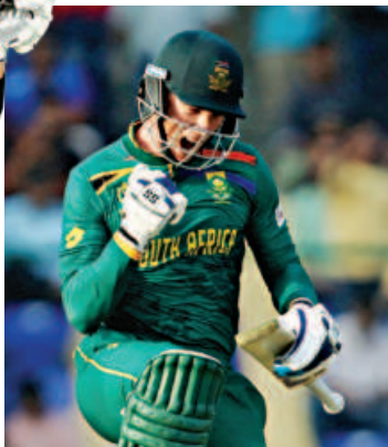
Rassie van der Dussen