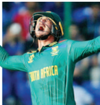
Quinton de Kock