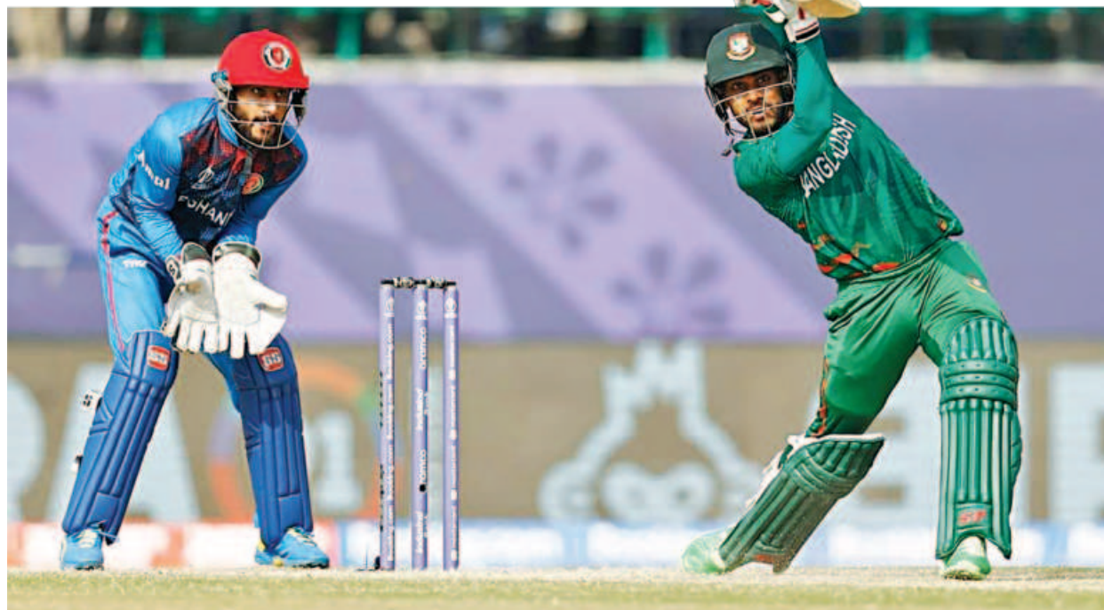
Bangladesh's Mehedi Hasan Miraz holds his pose after a cover drive against Afghanistan in Dharamshala yesterday. The 25-year-old produced an all-round display, helping the Tigers begin their World Cup 2023 with a six-wicket win.