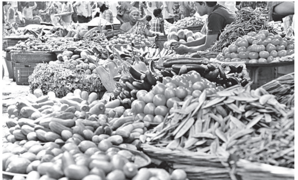
Only two countries, Bangladesh and Turkiye, thought they were isolated from the financial crisis. So, policymakers were traditional in implementing ideas.

Is our country decoupled from the global economy? Only two countries, Bangladesh and Turkiye, thought they were isolated from the financial crisis. So, policymakers were traditional in implementing ideas. The central bank's indecision to raise interest rates and the absence of appropriate foreign exchange rate policies generated macroeconomic chaos. Although both countries realised it later on, it was too late. In these two economies, importers took full advantage of this situation to meet