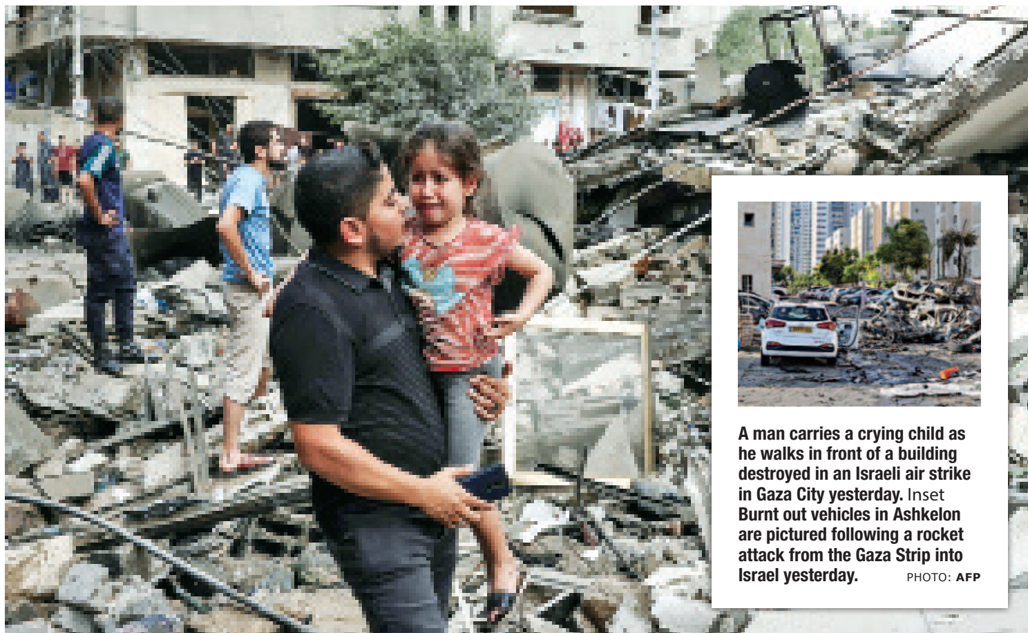
A man carries a crying child as he walks in front of a building destroyed in an Israeli air strike in Gaza City yesterday. Inset: Burnt out vehicles in Ashkelon are pictured following a rocket attack from the Gaza Strip into Israel yesterday.