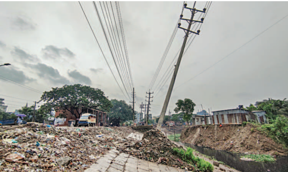
LEANING TOWER OF ELECTRICITY... One side of the Sadarghat-Gabtolli-Beribadh road was being used as a dumping ground for a long time. This electric pole was set up there on a thick layer of waste. However, after the city corporation cleaned the roadside, the pole started to tilt. The live electric wires hanging from the tilted pole may snap anytime and fall on pedestrians, which can cause a fatal disaster. The photo was taken in the Lalbagh area yesterday.

The ruling Awami League has deferred today's pre-scheduled rally to October 14, in compliance with an order from the Party President and Prime Minister Sheikh Hasina. Considering the suffering of the party's activists and supporters due to heavy rains, Hasina ordered the postponement of today's rally, scheduled to take place at Kawla Civil Aviation ground in Dhaka. The rally will now be held at the same venue on October 14 at 2:00pm, said a press release, undersigned by William Pralay Samaddar, office secretary of Dhaka (North) AL.