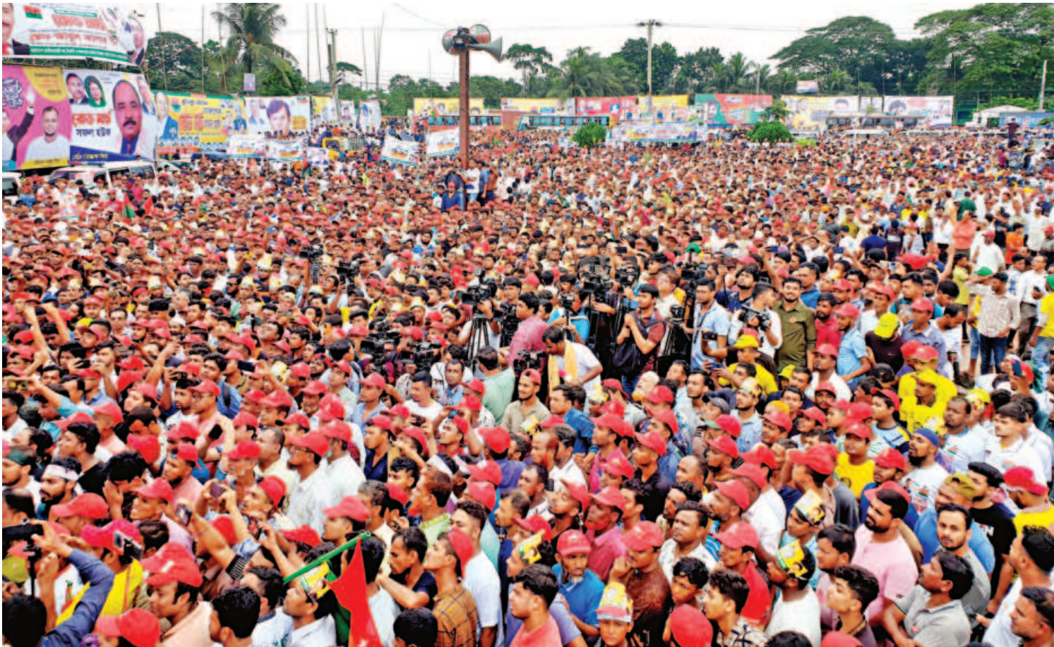
BNP leaders and activists pour into Kalakachua area of Cumilla's Burichang upazila yesterday before the start of a road march to Chattogram. The party organised the programme as part of its one-point movement demanding resignation of the government and general elections under a non-party neutral administration.