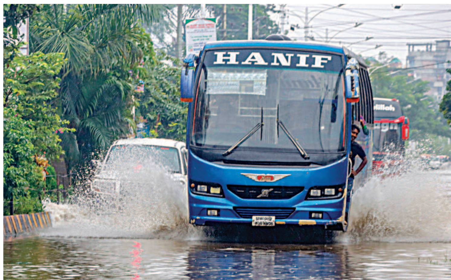
A bus negotiates the waterlogged Sonadanga-Natunrasta road in Khulna city's Abu Naser Mor area. Many roads across the city have been flooded with rainwater as the sewers remain clogged with various kinds of waste, including plastic. The photo was taken yesterday.