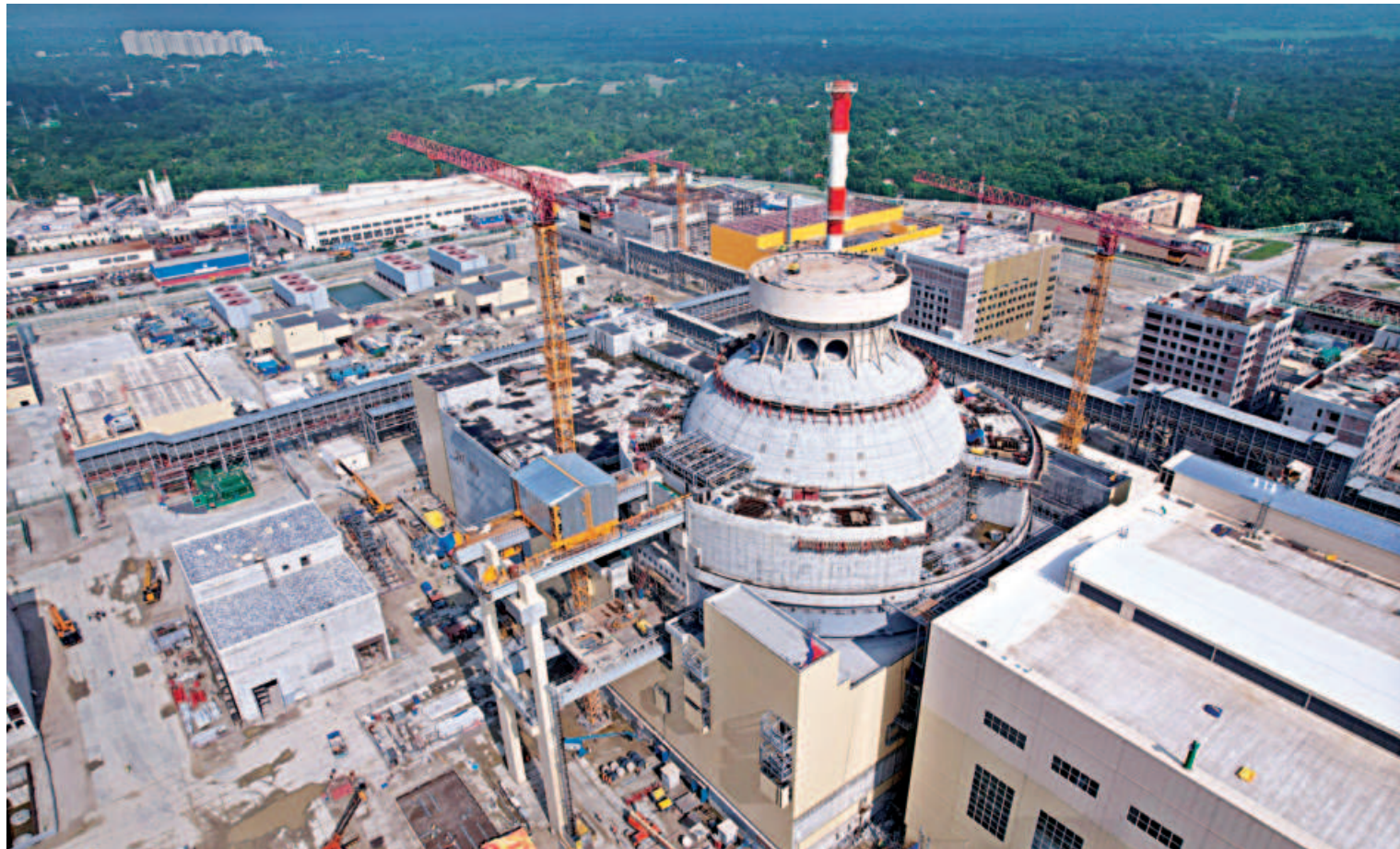
An aerial view of the under-construction Rooppur Nuclear Power Plant in Pabna. The first plant of this kind in Bangladesh is all set to officially receive its nuclear fuel today.