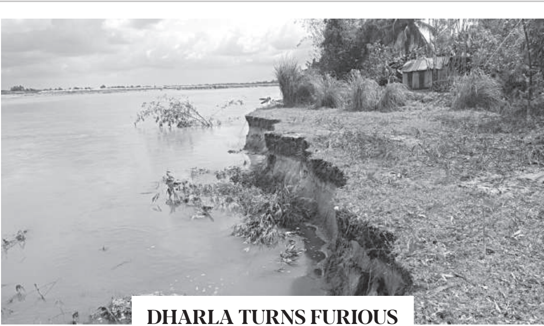
DHARLA TURNS FURIOUS

These accidents resulted in 184 fatalities and 777 injuries. Of them, 590 were related to road accidents, while others were attributed to gas cylinder mishaps, gas pipeline faults, elevator accidents, lightning strikes, and drowning in water bodies. In Dhaka, 11 individuals were killed in 49 different types of accidents. Mirpur, Mohammadpur, Tejgaon, and Old Dhaka had the highest frequency of accidents. Overall, 159 accidents took place in Dhaka, 55 in Mymensingh, 102 in Chattogram, 201 in Rajshahi, 88 in Khulna, 27 in Sylhet, 41 in Barishal, and 114 in Rangpur. The Fire Service and Civil Defense responded to 4,354 calls for fire and various accidents in September. They also provided ambulance services for 1,098 patients through 1,152 calls.