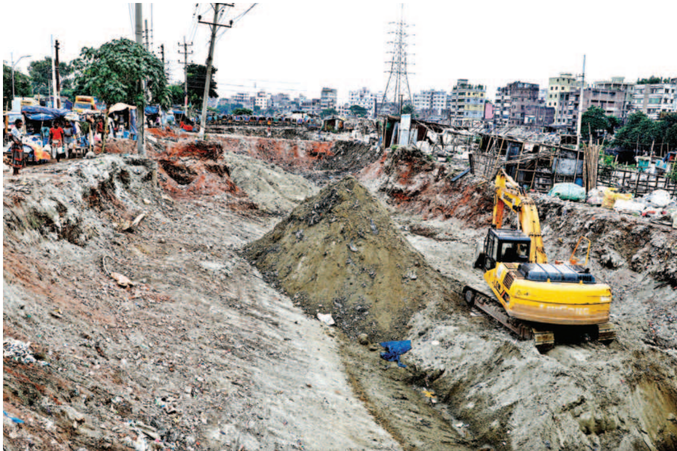
With an excavator, Dhaka South City Corporation is restoring the old channel of the Buriganga river that has been clogged and occupied by encroachers for years. The photo was taken near the Lalbagh Beribandh Road on Monday.