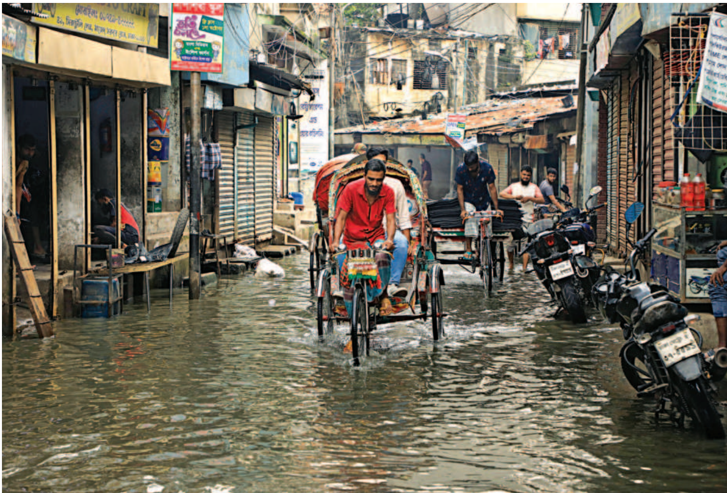
Sewage from residential and commercial buildings floods Mazed Sardar Road in Old Dhaka. Locals said the sewerage is clogged and the water level increases during the afternoon. The photo was taken yesterday.