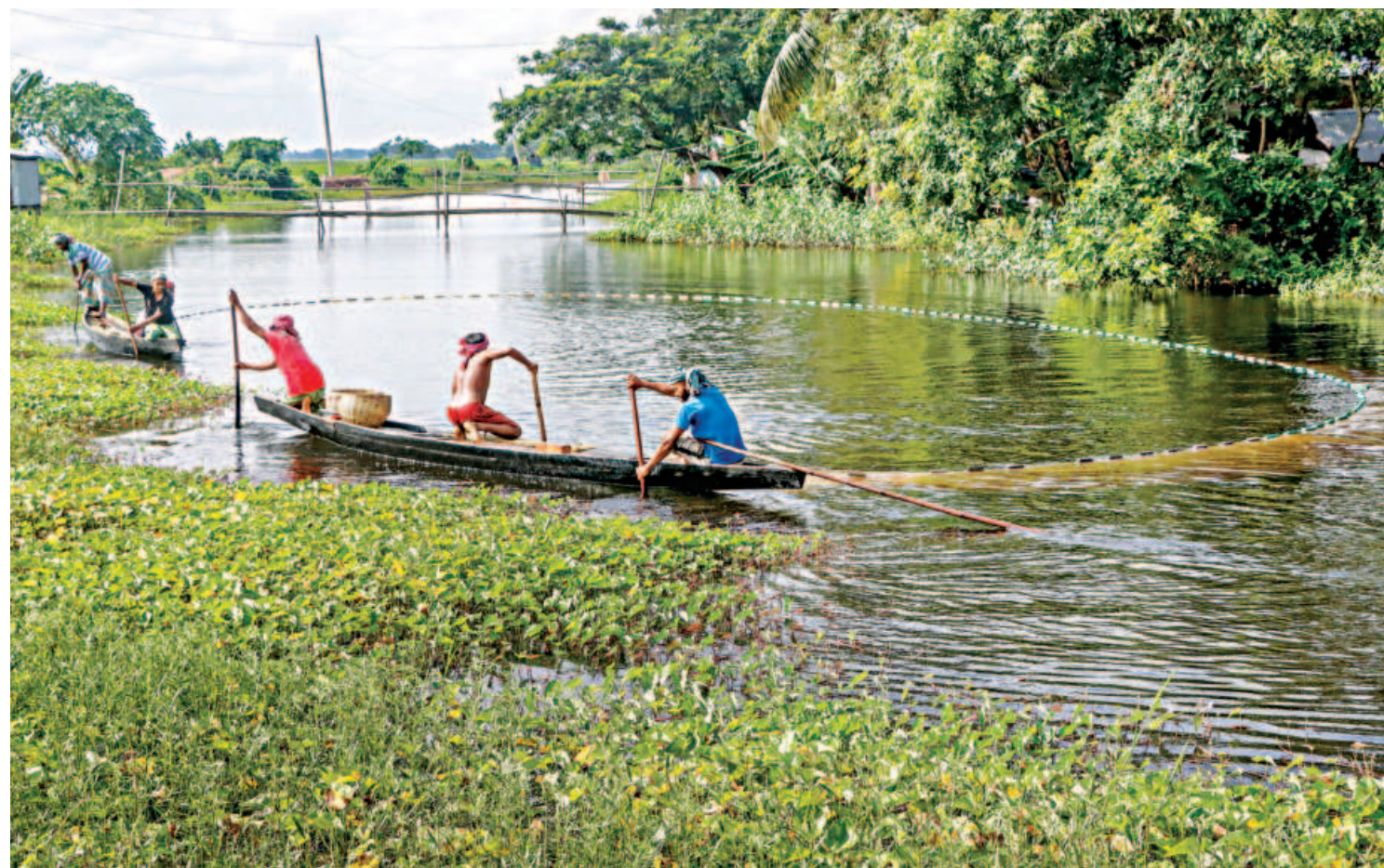
Six fishermen on two boats cast their fishing net, hoping for a good haul, at a canal in Khulna's Terokhada upazila. Many fishermen of the upazila's Bamondanga village venture out to different waterbodies nearby to catch a variety of fish -- tengra, taki and prawns -- and make a living. Each of them earn around Tk 400-500 per day by selling the fish. The photo was taken yesterday.