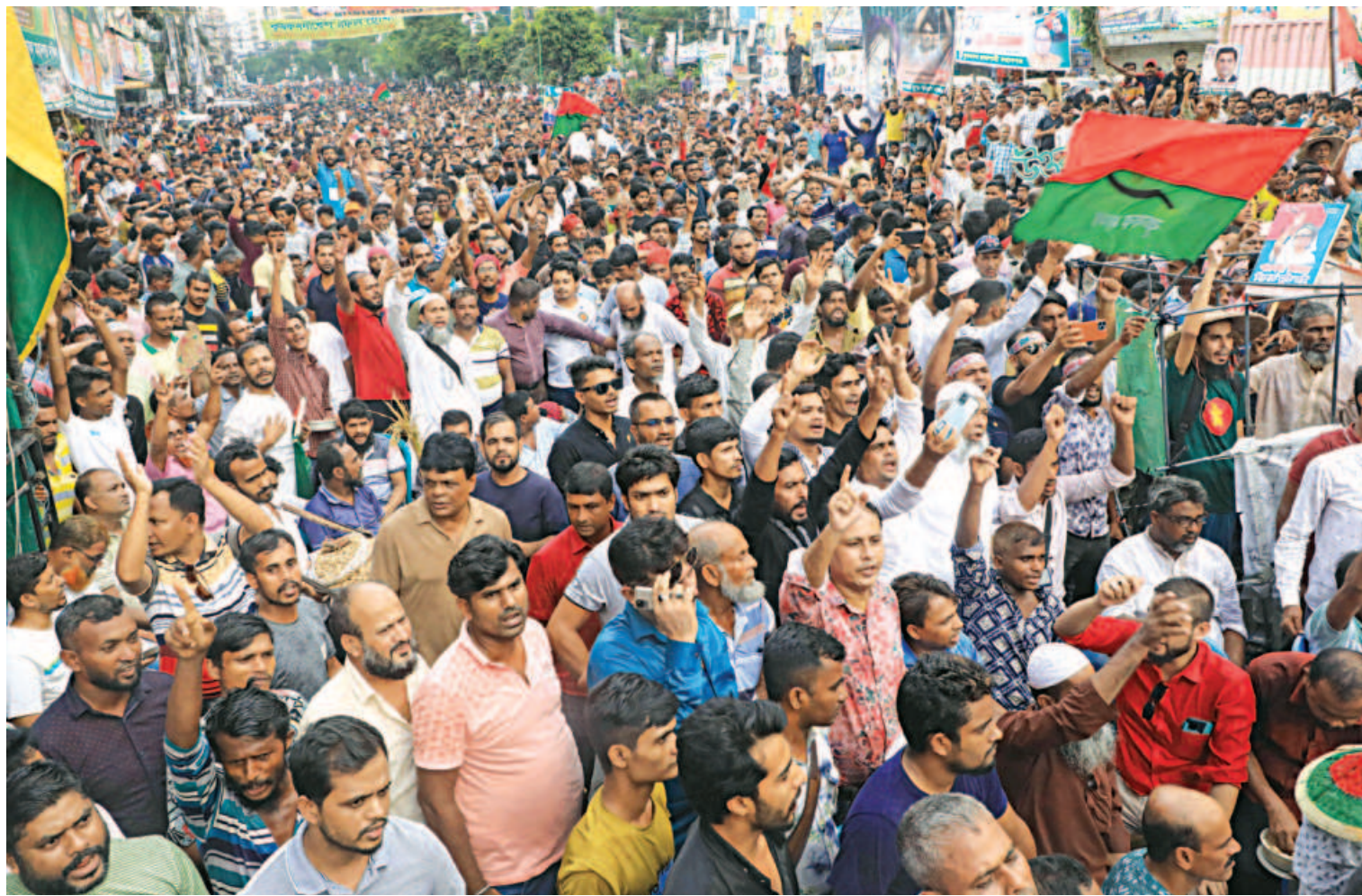
Leaders and activists of Jatiyatabadi Krishak Dal, the farmers' wing of the BNP, at a rally in front of the party's Nayapaltn central office yesterday. They demanded resignation of the government, national election under a neutral interim government, and BNP Chairperson Khaleda Zia be freed.