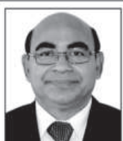
Chairman (Additional Charge) & Member University Grants Commission of Bangladesh