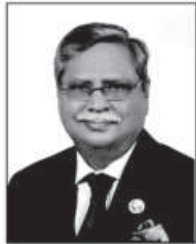
PRESIDENT PEOPLE'S REPUBLIC OF BANGLADESH BANGABHABAN, DHAKA 18 Ashwin 1430 03 October 2023

On the solemn occasion of the 8th Convocation of Uttara University, I extend my warmest congratulations to the graduating students, their parents, esteemed faculty members, and the university authority.