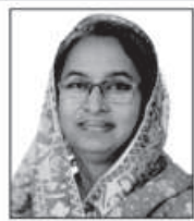
Minister Ministry of Education Government of the People's Republic of Bangladesh