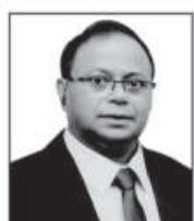
Founder Vice-Chancellor Uttara University Uttara, Dhaka, Bangladesh