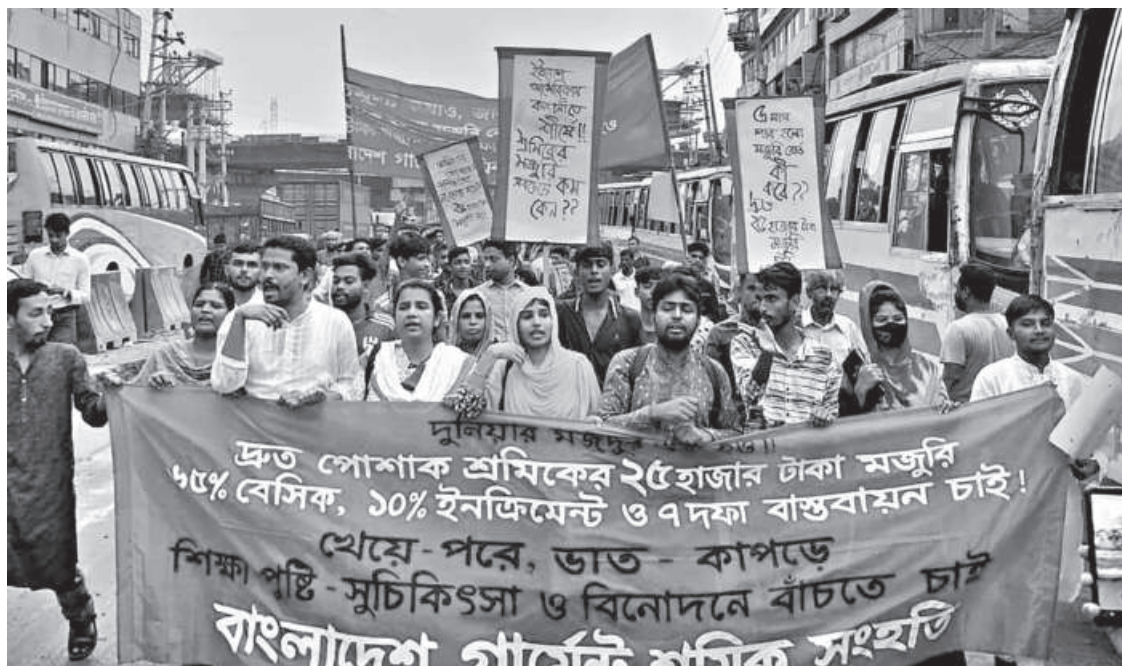
Bangladesh Garment Workers' Solidarity, a labour rights organisation, has been demanding Tk 25,000 as minimum wage.