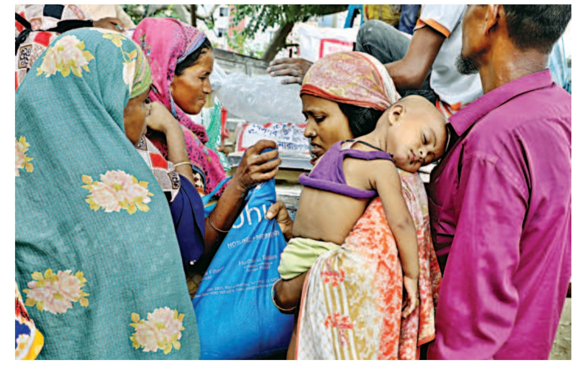
With despair and frustration painted all over her face, a woman holding her sleeping baby finally gets to purchase subsidised rice and flour from a government truck after a wait of two hours under the scorching sun. With hikes in the prices of essentials, the desperation of low-income people for affordable food is increasing every day. This photo was taken in Mohammadpur yesterday.

Their demands include eliminating inter-cadre discriminations, promoting all eligible officers to supernumerary positions, provision of earned leaves, and cancelling officer recruitment rules of primary schools and madrasas.