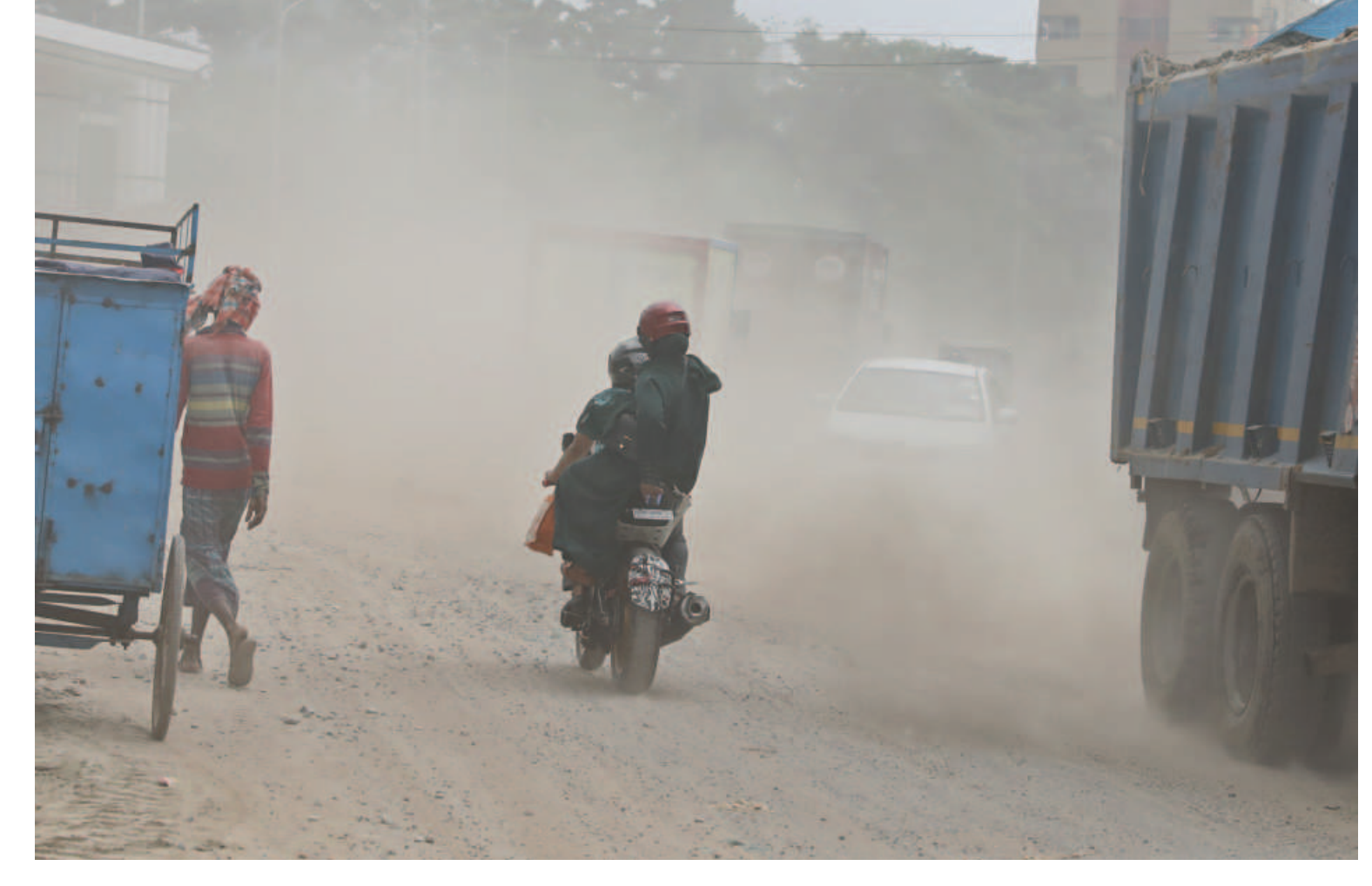
Dust covers the Gabtoli-Sadarghat-Beribadh road, blurring the vision of commuters and making it risky for drivers to ply through. The situation is particularly concerning as Dhaka is often ranked as the city with the worst air, with a WHO report stating that outdoor air pollution led to 240,000 deaths in Bangladesh in 2019. The photo was taken yesterday.

extension on Sunday. On September 9, ADC Harun and some other police officials took two BCL leaders to the police station around 9:00pm and tortured them for about an hour, BCL leaders alleged.