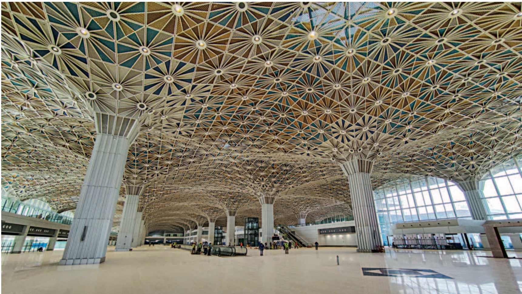
The immaculate floor and eye-catching patterns on ceiling of the third terminal of the Hazrat Shahjalal International Airport. The modern terminal is set to have a soft opening on October 7. Story on page 12.

➔ Cost escalated -- 7 projects (From 24.73 % to 260.81%)