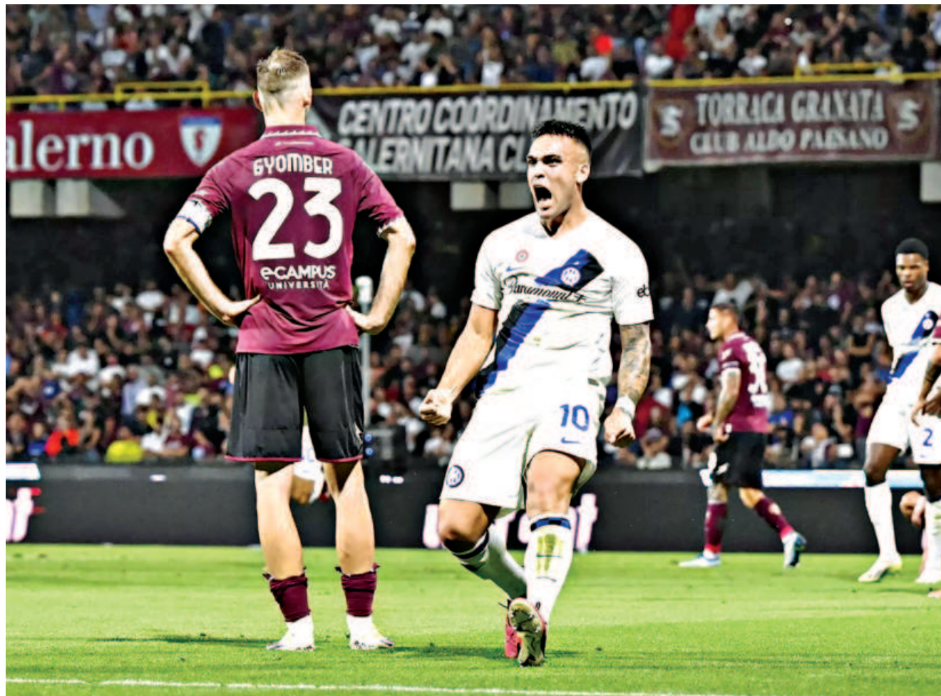
Having come off the bench in the second half, Lautaro Martinez turned things around all by himself as he bagged four goals in just 27 minutes to see Inter Milan secure a 4-0 victory at Salernitana on Saturday. The win propelled Inter back to the top of Serie A.