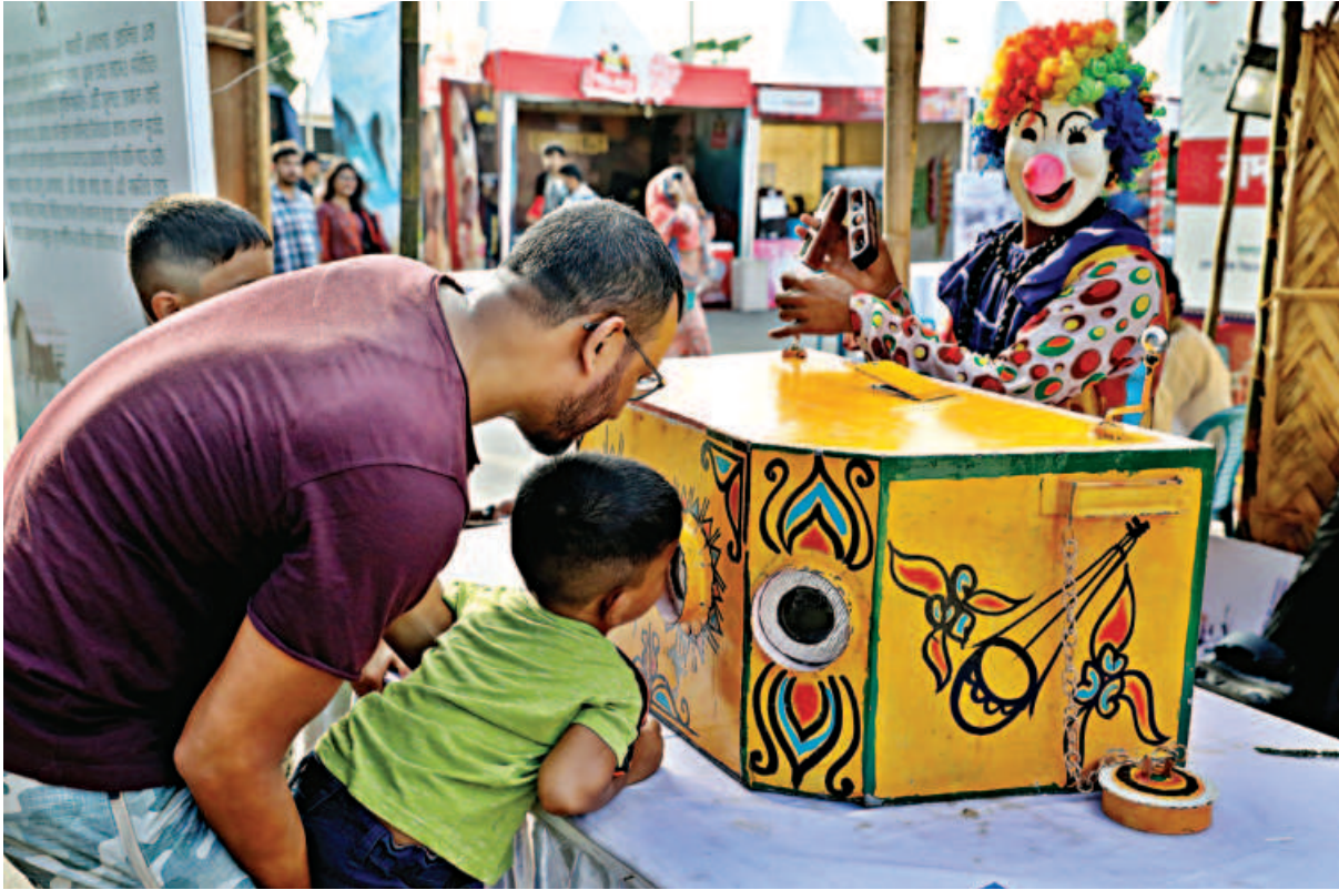
A child looks through the view hole of a bioscope, trying to discover a world hidden inside the portable device. Many such rural traditions, now lost to urbanisation, were on display at the four-day “Bangladesh Festival” at BICC in Dhaka yesterday. The Tourism Board organised the event. At the fair, visitors were also able to enjoy regional delicacies and buy various hand-woven fabrics made by local weavers.