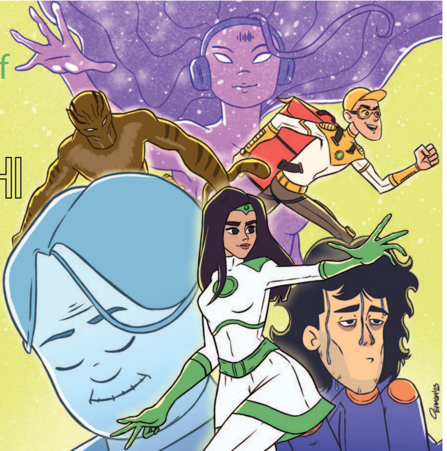
ILLUSTRATION: JUNAID IQBAL ISHMAM