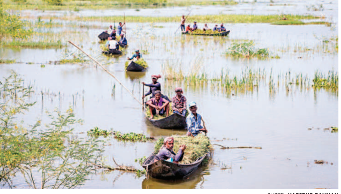
Farmers transporting Aush paddy to their homes by boats in Hathgachha Beel of Jashore's Monirampur upazila. Farmers in Bhabadaha region can grow only one crop a year because the area remains waterlogged for most part of the year due to the authorities' failure to manage water flows from local rivers. The photo was taken yesterday.

As of September 26, which is the latest published data by the BB, SEE PAGE 2 COL 1