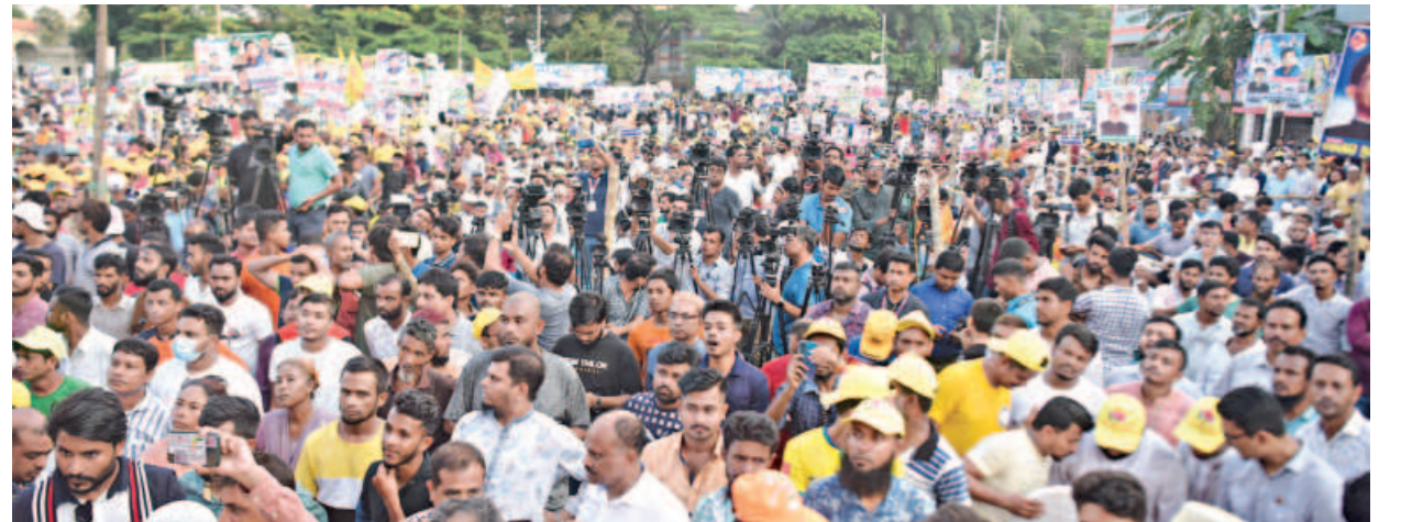
Leaders and activists of Awami League at a rally at Tongi Government School premises. Gazipur city AL organised the programme yesterday. The event was part of a series of rallies the ruling party rolled out to counter BNP's demonstrations on the streets.