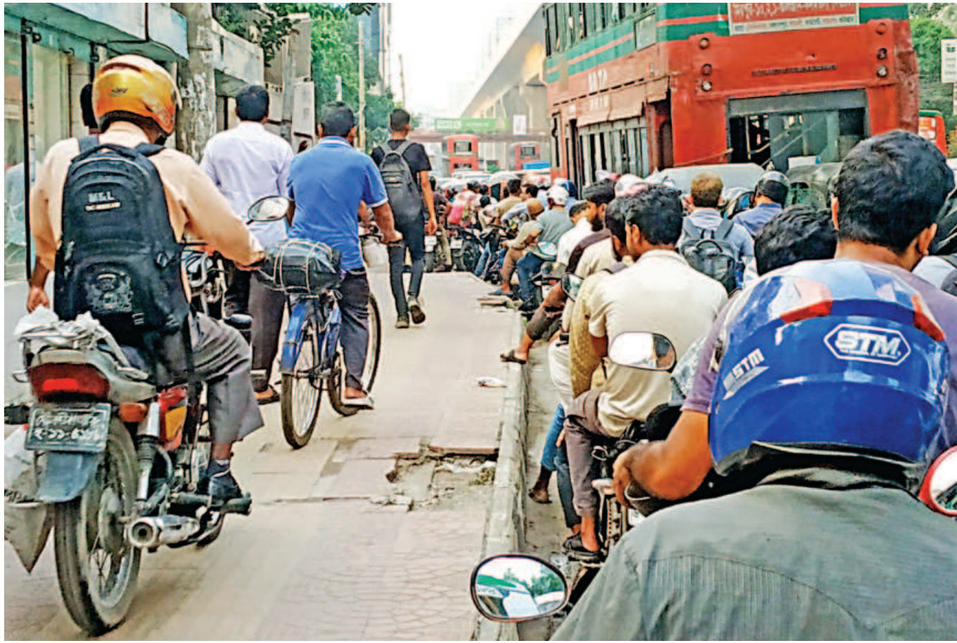
Even footpaths are not spared from traffic jam, as motorcycles and bicycles illegally occupy the space meant for pedestrian movement. The photo was taken near the capital's Bangla Motor yesterday.

On May 24 this year, the US said it would impose visa restrictions on individuals and their immediate family members "if they are responsible for, or complicit in, undermining the democratic election process in Bangladesh."