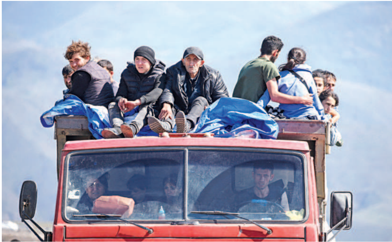
Refugees from Nagorno-Karabakh region ride in a truck upon their arrival at the border village of Kornidzor, Armenia yesterday. More than a third of population has fled the enclave since Azerbaijan crushed the rebels' decades-long fight for an independent state last week.