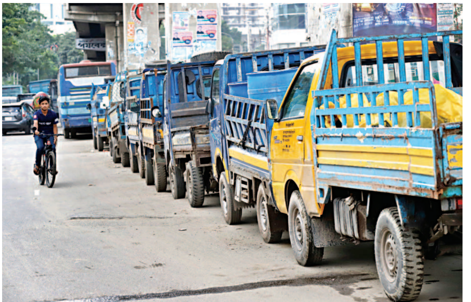
An array of pick-up trucks, parked illegally beneath the Mouchak-Moghbar flyover, takes up a significant part of the Panthapath-Tejgaon link road. The photo was taken recently near the flyover's Karwan Bazar end in the capital.