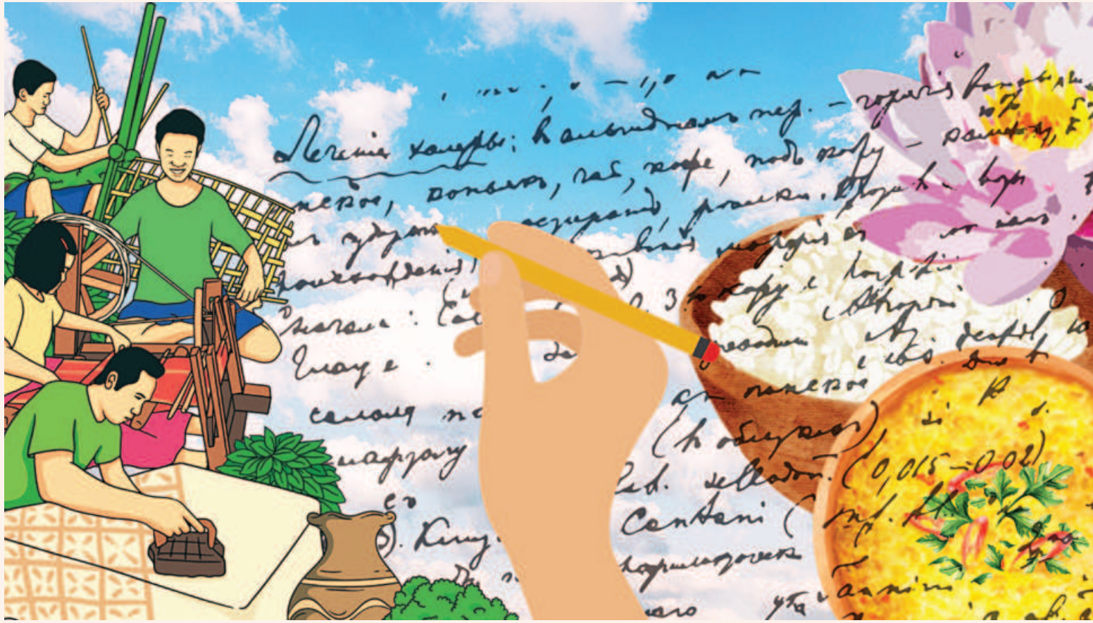
DESIGN: MAISHA SYEDA

How reading 'Letters to a Writer of Colour' (Penguin Random House UK, 2023) shows us a possibility for Bangladeshi writers to make it big