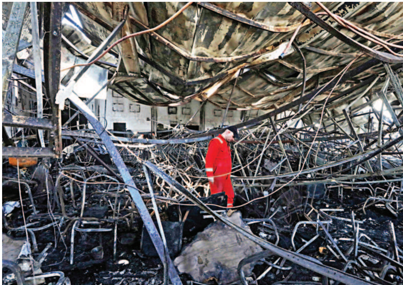
A firefighter checks the damage in an event hall following a fatal fire at a wedding celebration, in the district of Hamdaniya in Nineveh province, Iraq yesterday.

These include China's Light Tank, SEE PAGE 2 COL 2