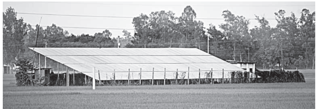
A solar irrigation pump in Shibganj upazila, Bogura.

SIPs will also greatly help in curbing carbon dioxide (CO 2 ) emissions in the country. According to the Bangladesh Petroleum Corporation, we import