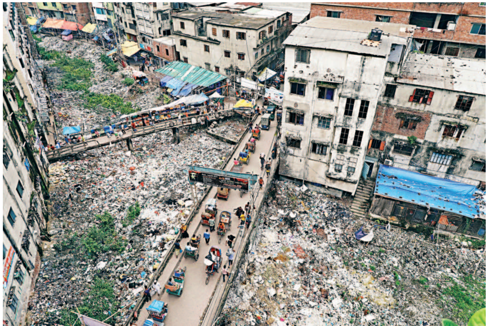
The Shuvaddya canal in Dakshin Keraniganj has literally been turned into a dumping ground by sweatshops and traders of kitchen markets, leaving no room for water to flow. The photo was taken yesterday.

➤ 13pc of women and 32pc of men say if the public transport was better, they would have preferred it over cars