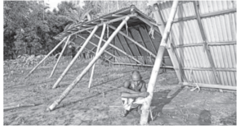
Several villages in Jhenidah and Magura are on the verge of disappearing from the map due to the Madhumati river erosion. Inset, the situation is similar in Kurigram and Lalmonirhat where the Teesta has continued to devour homesteads and arable lands. The photos were taken recently.