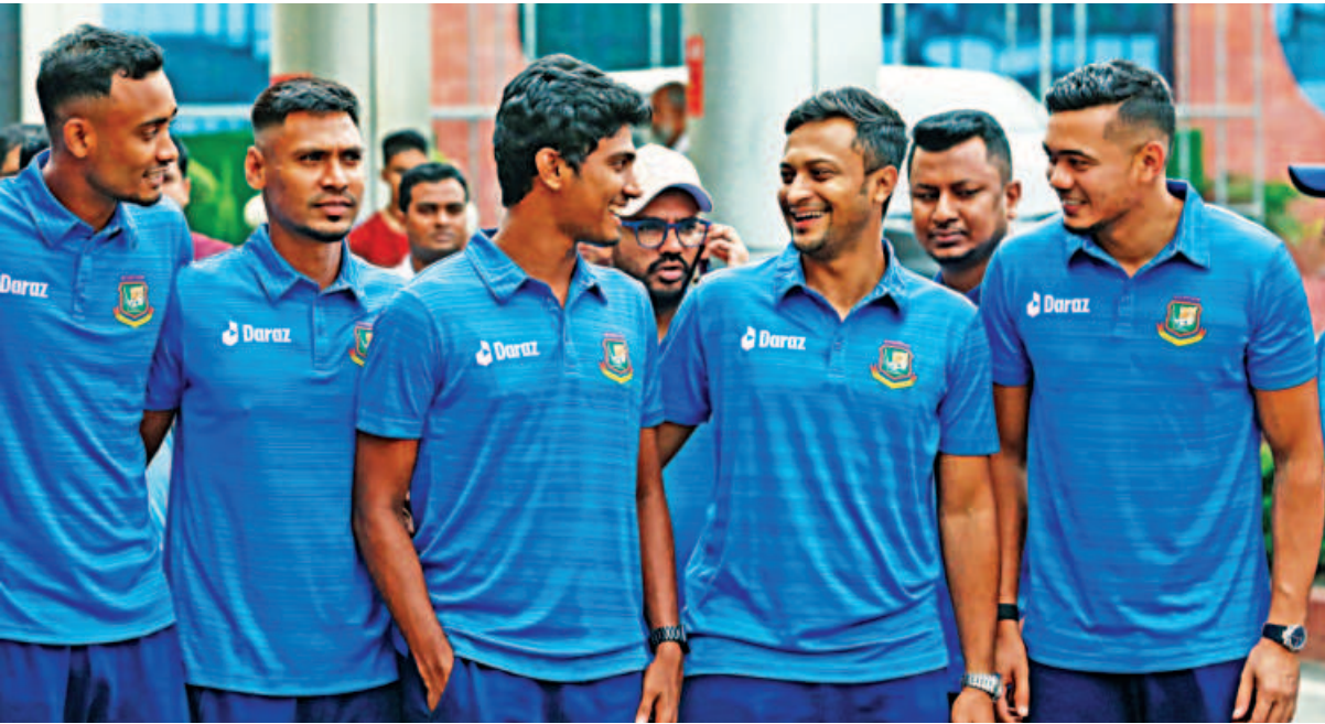
Bangladesh captain Shakib Al Hasan shares a light moment with teammates at the BCB headquarters in Mirpur yesterday afternoon prior to their departure for India to play the World Cup. They will play the first of their two practice matches against Sri Lanka tomorrow in Guwahati.