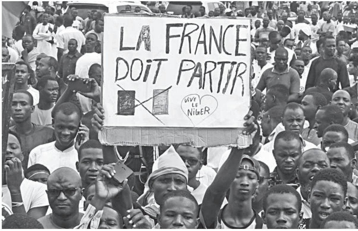
On September 24, French President Emmanuel Macron said that French troops would be withdrawn from Niger in the next couple of months, in the wake of a coup d'état in the Western African country this summer.