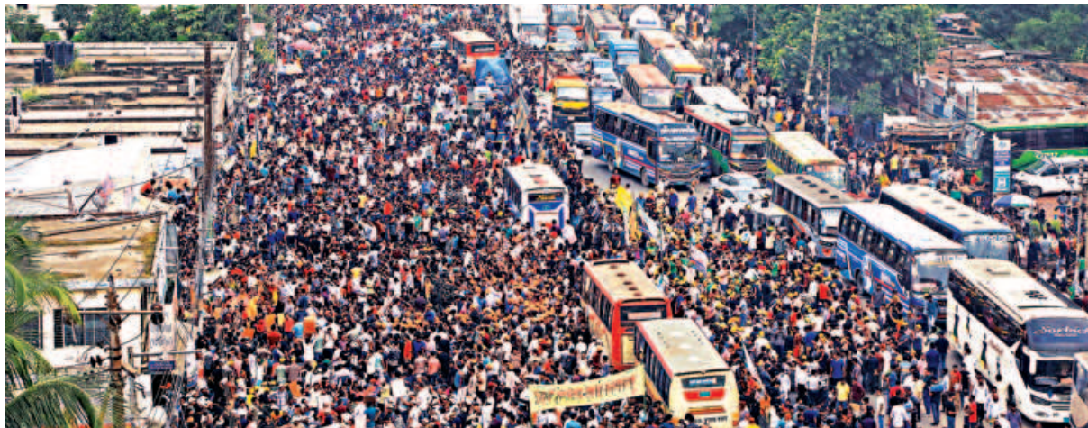
BNP leaders and activists at a rally in the capital's Gabtoli yesterday. The party's Dhaka south city unit organised the event as part of its one-point movement, demanding resignation of the government and general election under a non-party interim government.