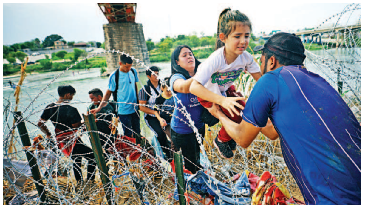
Migrants from Venezuela make their way through the razor wire after crossing the Rio Grande into the United States in Eagle Pass, Texas, US on Tuesday.

"What we have control over is our healthcare system and we have to strengthen it so that we don't face such a dreadful outbreak in the future."