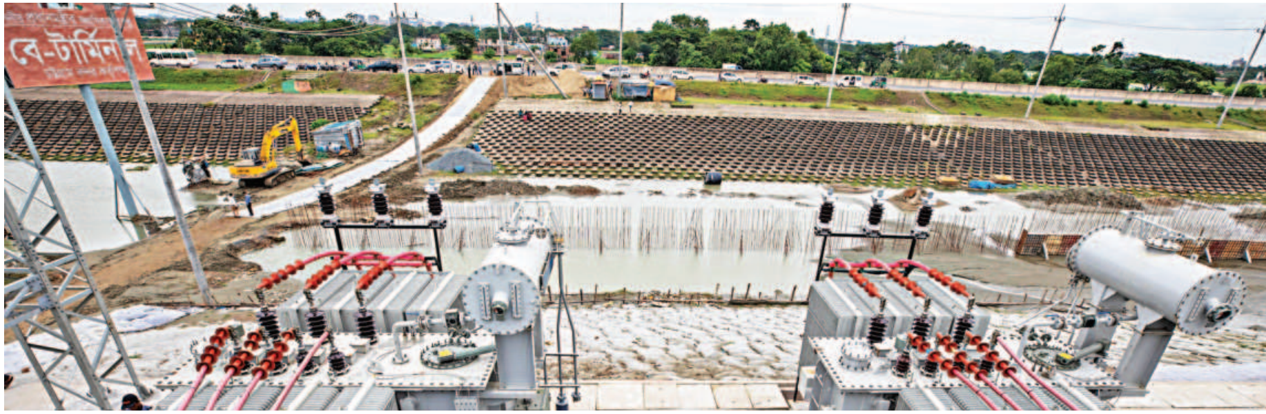
The proposed Bay Terminal is being set up on around six-kilometre-long stretch from the back of Chattogram Export Processing Zone to Rashmonighat.