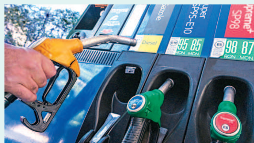
A driver prepares to fill his vehicle with gasoline at a service station in the southern French city of Montpellier.

once it had stabilised its domestic market, but did not give a precise timeline.