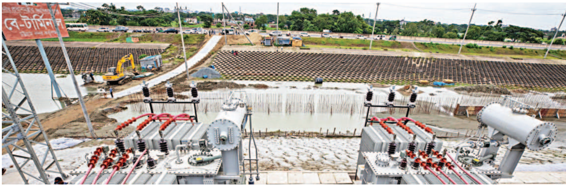
The proposed Bay Terminal is being set up on around six-kilometre-long stretch from the back of Chattogram Export Processing Zone to Rashmonighat.