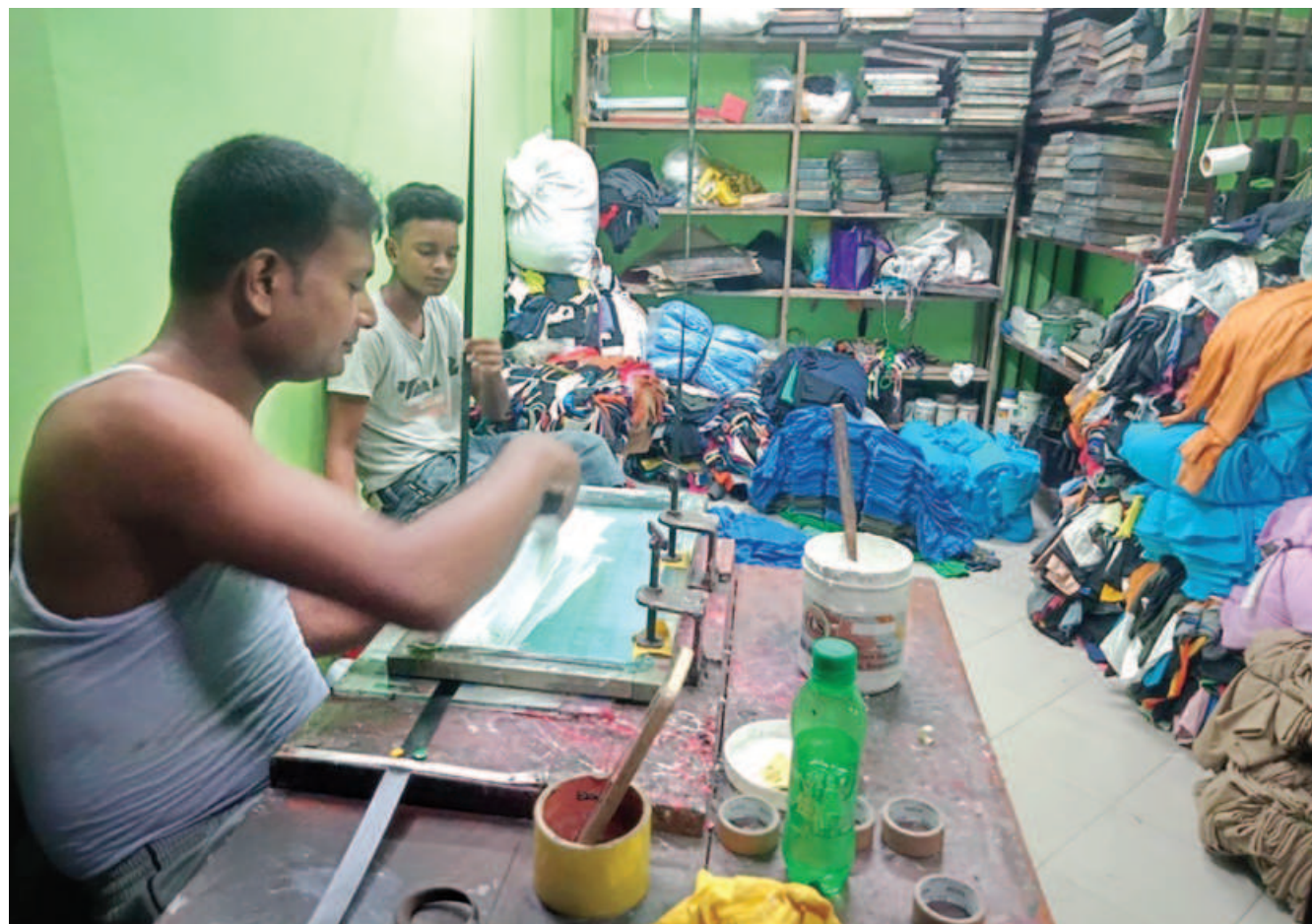
Workers at a facility at the AR Corner Market, the biggest hub of garment products in Pabna, imprint clothes with various designs before putting them up for sale.

Last year's economic crash sparked dire food, fuel and medicine shortages, as well as months of civil unrest that eventually toppled then president Gotabaya Rajapaksa.