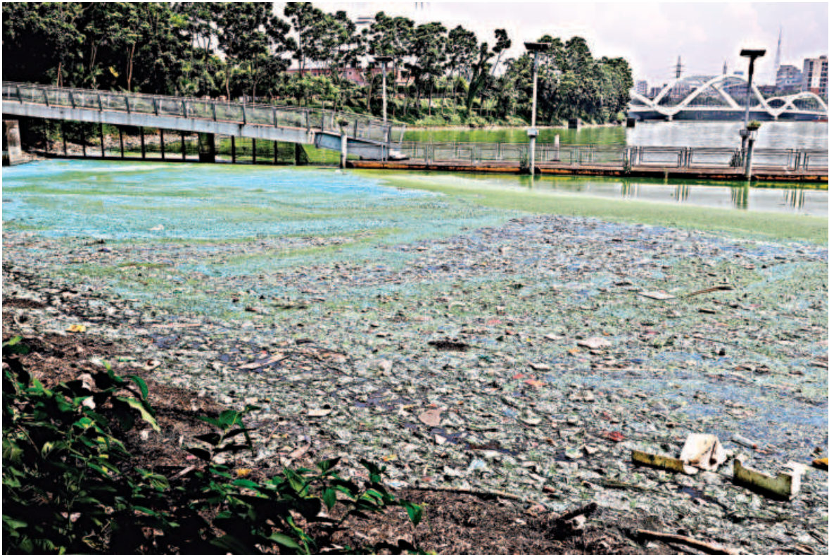
Overgrown bushes, dumped non-biodegradable waste, and algae choke the Kunipara end of Hatirjheel lake in the capital. The current state of the water poses a serious threat to the waterbody's marine biodiversity while its stench is unbearable for the area's residents. The photo was taken recently.

Techniques (SoMaSHTe), presented the research findings at a stakeholders' consultation on media self-regulation during "Research Findings Dissemination and Opinion Mobilization," held at The Daily Star Centre yesterday. "The constitution of Bangladesh has mentioned the right to information and freedom of speech, but simultaneously, there are many laws used for suppressing the voice of journalists," the study said. The report also pointed out the absence of any specific law to protect journalists. In addition to this, two more research reports were also presented at the event. "Bangladeshi media leaders and professionals are worried about the SEE PAGE 4 COL 7