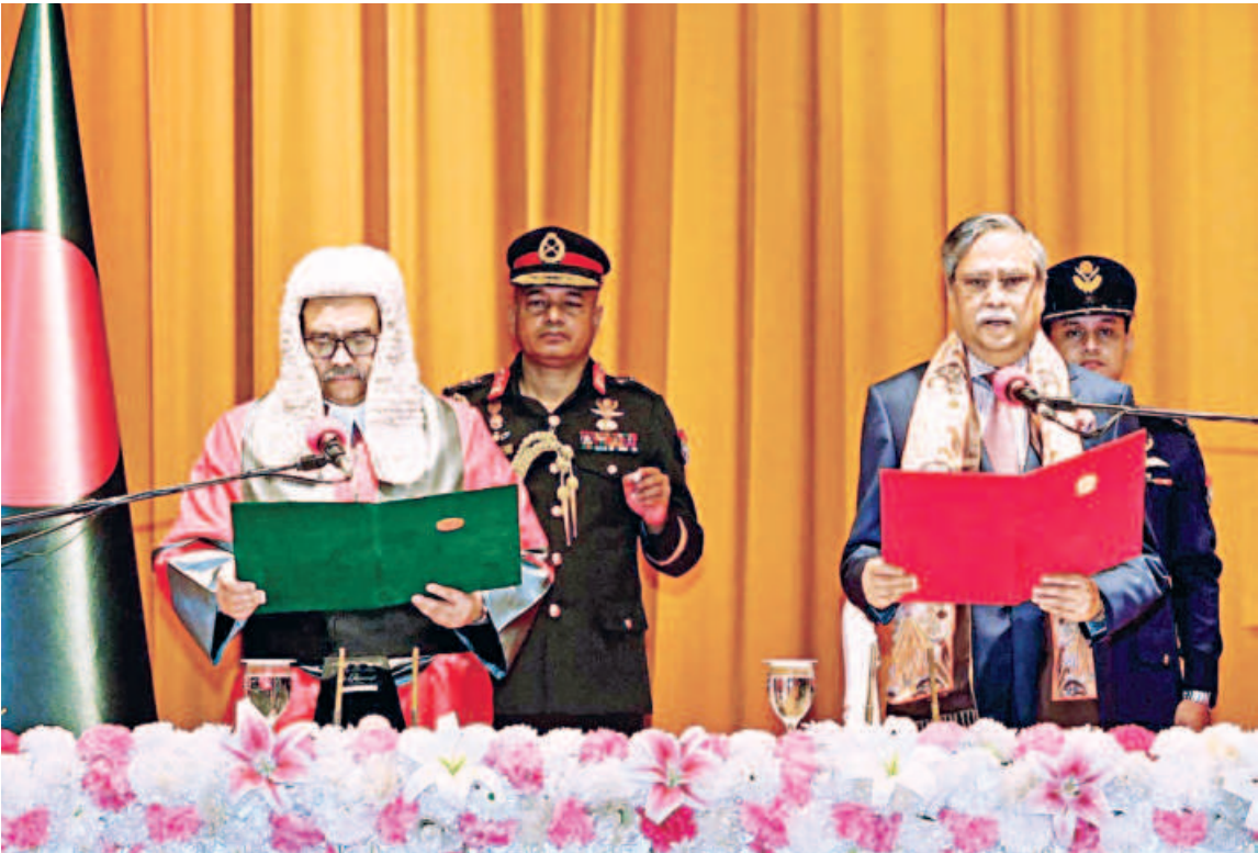
Justice Obaidul Hassan taking oath as the 24th chief justice. President Mohammed Shahabuddin administered the oath at Bangabhaban yesterday morning.

Justice Obaidul Hassan took oath as the 24th chief justice of Bangladesh yesterday. President Mohammed Shahabuddin administered the oath at Darbar Hall of Bangabhaban, the official residence of the president, at 11:00am, Supreme Court sources told The Daily Star. The prime minister was not present at the new chief justice's oath taking ceremony as she is abroad. Hassan, a senior judge of the Appellate Division, was appointed the 24th chief justice of the country on September 12.