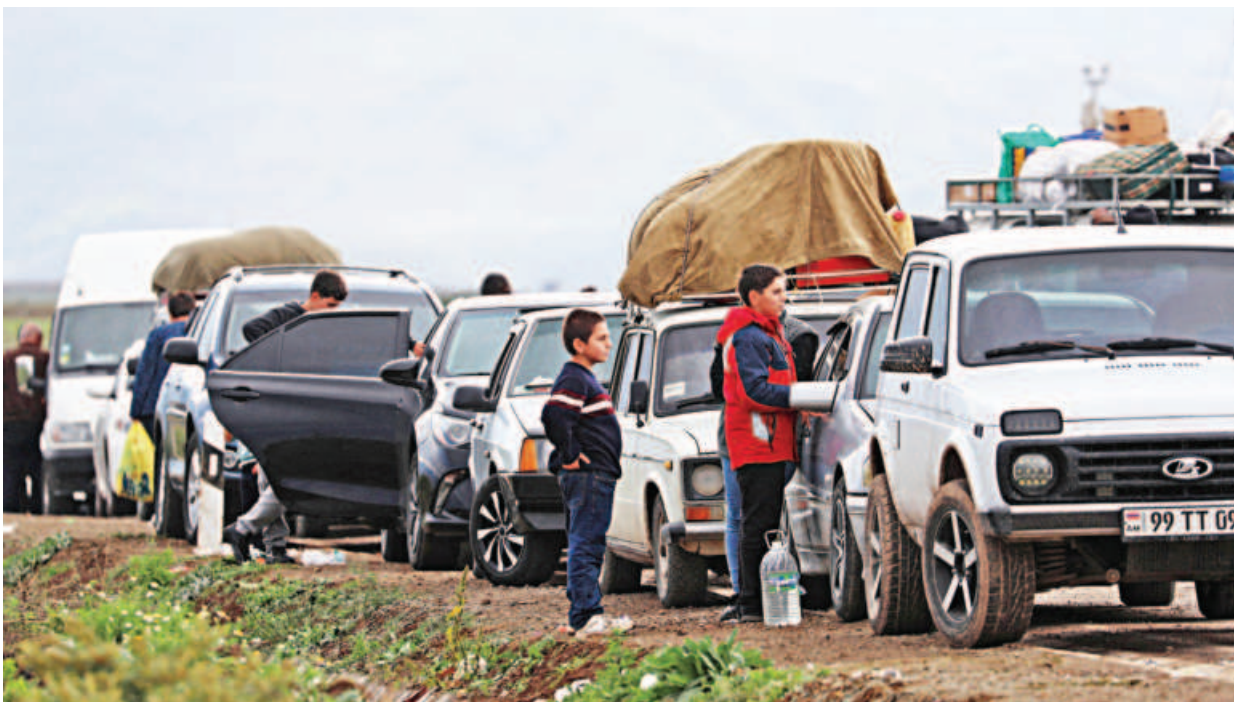
Children stand next to cars as refugees from Nagorno-Karabakh region arrive in the border village of Kornidzor, Armenia yesterday.