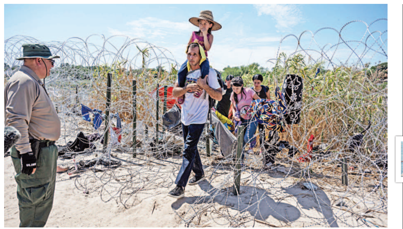
Migrants from Venezuela walk through a hole in the razor wire cut by US Border Patrol agents after they crossed the Rio Grande to Eagle Pass, Texas, on Sunday. Dozens of migrants arrived at the US-Mexico border, hoping to be allowed into the United States, with US border forces reporting 1.8 million encounters with migrants in the last 12 months.

After decades of being treated as a relative backwater, South Pacific has become an important arena for competition between the US and China.