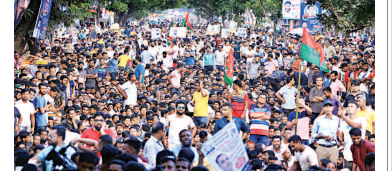
BNP leaders and activists at a rally in the capital's Dholaikhal yesterday. The party's Dhaka south city unit organised the meeting as part of its one-point movement demanding resignation of the government and general election under a non-party interim government.