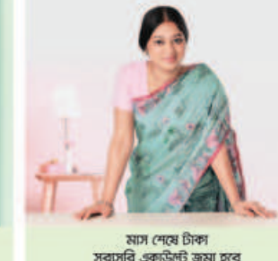
সরাসরি একাউন্টে জমা হবে