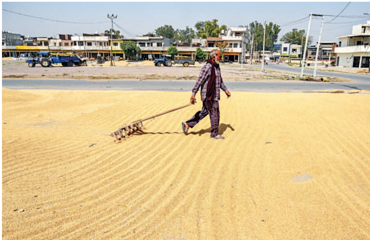
A labourer dries wheat grains at a wholesale market in Amritsar, India, the world's second-biggest producer and consumer of wheat, has been trying to contain food prices before the start of peak festival season next month.

It will "definitely" help Malaysia counter European curbs, he added.