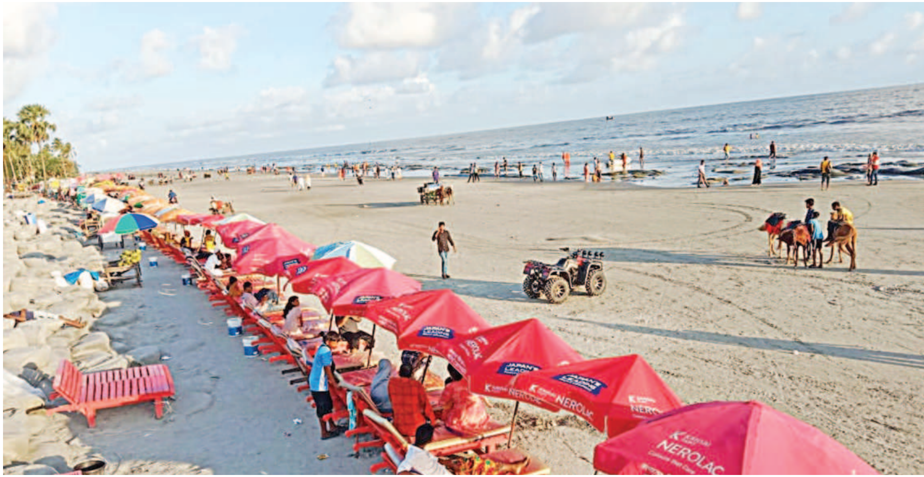
Although many visit the beachside in Kuakata to lounge and relax while taking in the picturesque view, there are numerous activities, including horses and ATVs available for rent. Around 5,000 people in the town base their livelihood on the tourism sector. The photo was taken yesterday.