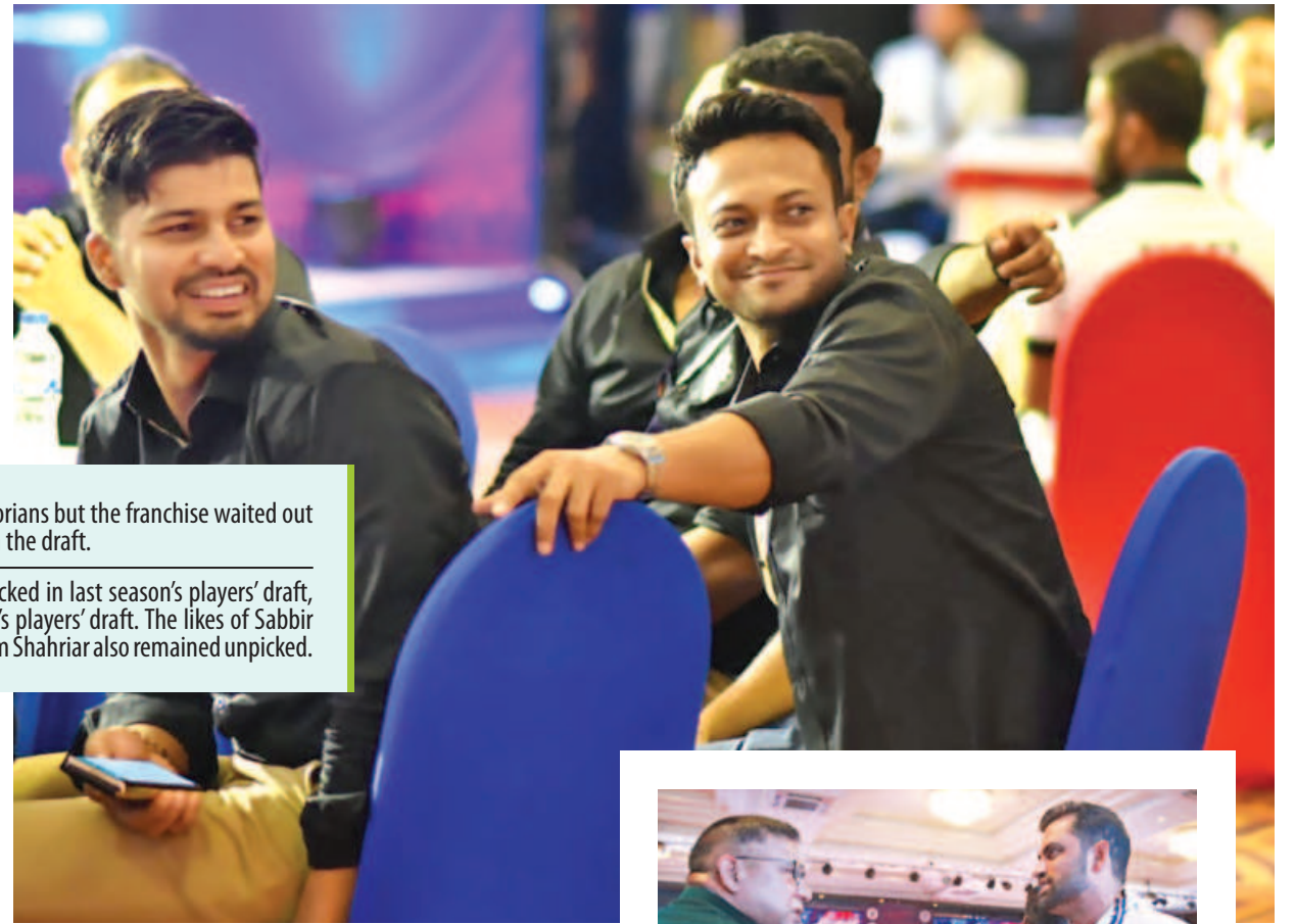
Bangladesh stalwarts Shakib Al Hasan and Tamim Iqbal were present with their respective teams Rangpur Riders and Fortune Barishal at the player's draft of the 10th edition of the Bangladesh Premier League at a city hotel yesterday.

A number of international stars are set to feature in the upcoming BPL with Rangpur picking up Babar Azam, Matheesha Pathirana, and Wanindu Hasaranga as direct overseas signing.