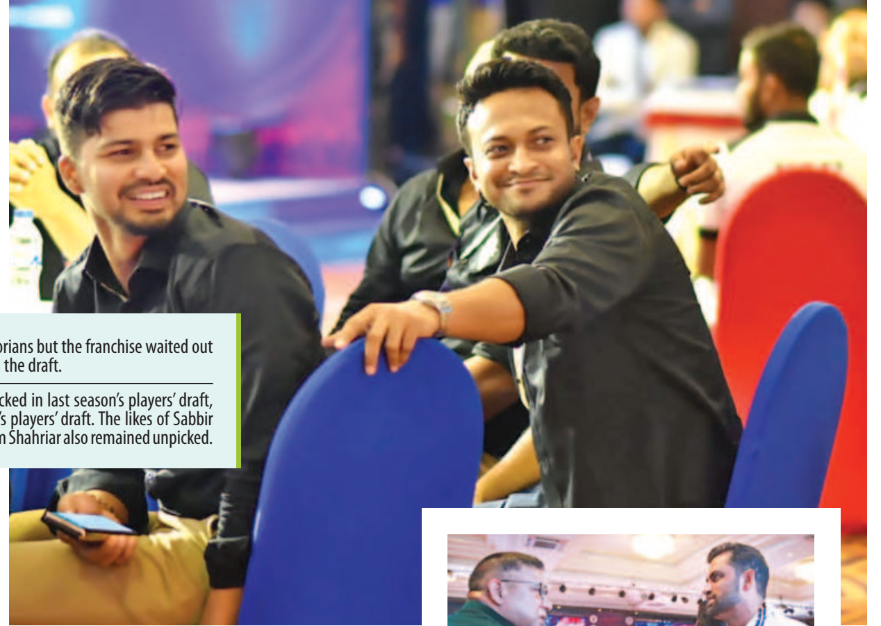
Bangladesh stalwarts Shakib Al Hasan and Tamim Iqbal were present with their respective teams Rangpur Riders and Fortune Barishal at the player's draft of the 10th edition of the Bangladesh Premier League at a city hotel yesterday.

A number of international stars are set to feature in the upcoming BPL with Rangpur picking up Babar Azam, Matheesha Pathirana, and Wanindu Hasaranga as direct overseas signing.