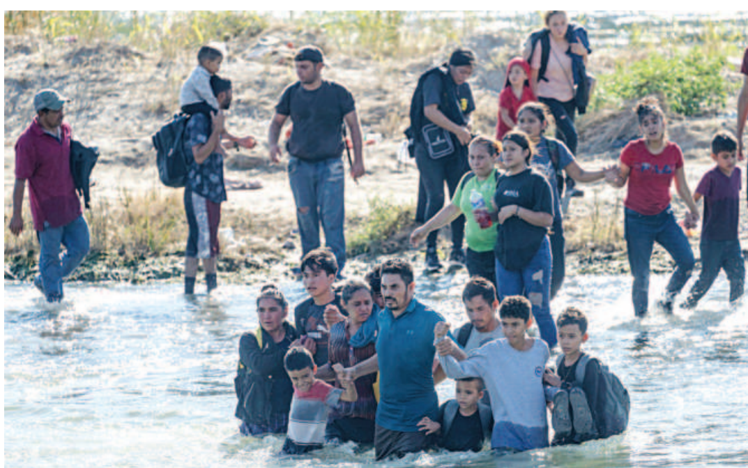
A family holds on as they try to navigate swift currents in the Rio Grand river as they cross the US-Mexico border to Eagle Pass, Texas, US on Saturday. The dramatic increase in migrants crossing the US border from Mexico has pushed the city of El Paso, Texas, to "a breaking point," with more than 2,000 people per day seeking asylum, exceeding shelter capacity, its mayor said.

At least 35 people were killed in southeastern Benin on Saturday after a fire broke out at a shop where witnesses said gasoline was being unloaded, a justice ministry representative said. The fire broke out at 0930 local time in Seme-Podji municipality, near the border with Nigeria. "The fire burned down the store and according to an initial assessment resulted in 35 deaths including one child," said Prosecutor Abdoukaki Adam-Bongle in a ministry statement, adding that an investigation had been opened to determine the cause.