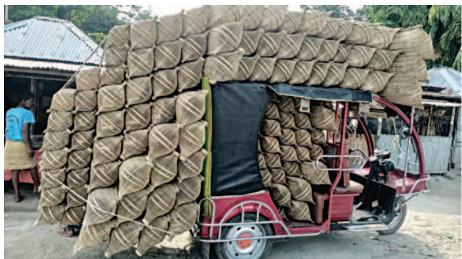
A craftsman carries teprai by a battery-run auto-rickshaw to Chaparhat Bazar in Lalmonirhat's Kaliganj upazila for sale.