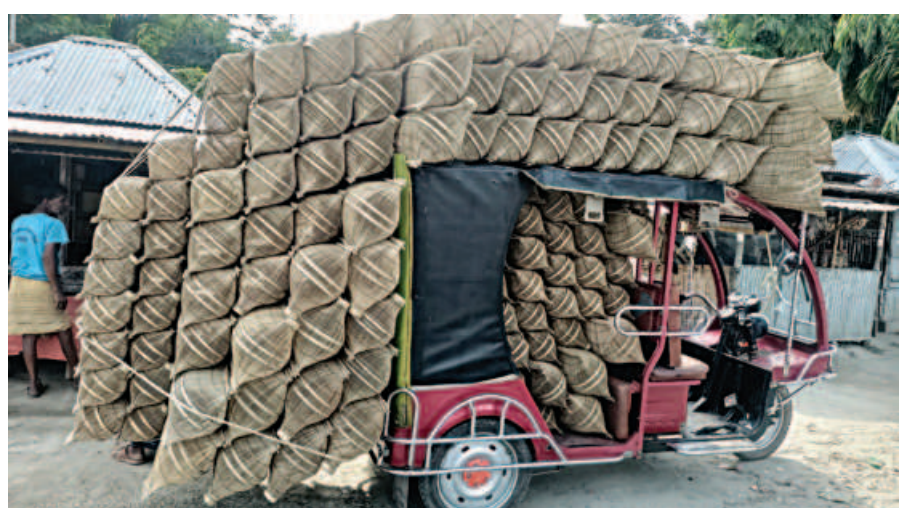
A craftsman carries teprai by a battery-run auto-rickshaw to Chaparhat Bazar in Lalmonirhat's Kaliganj upazila for sale.