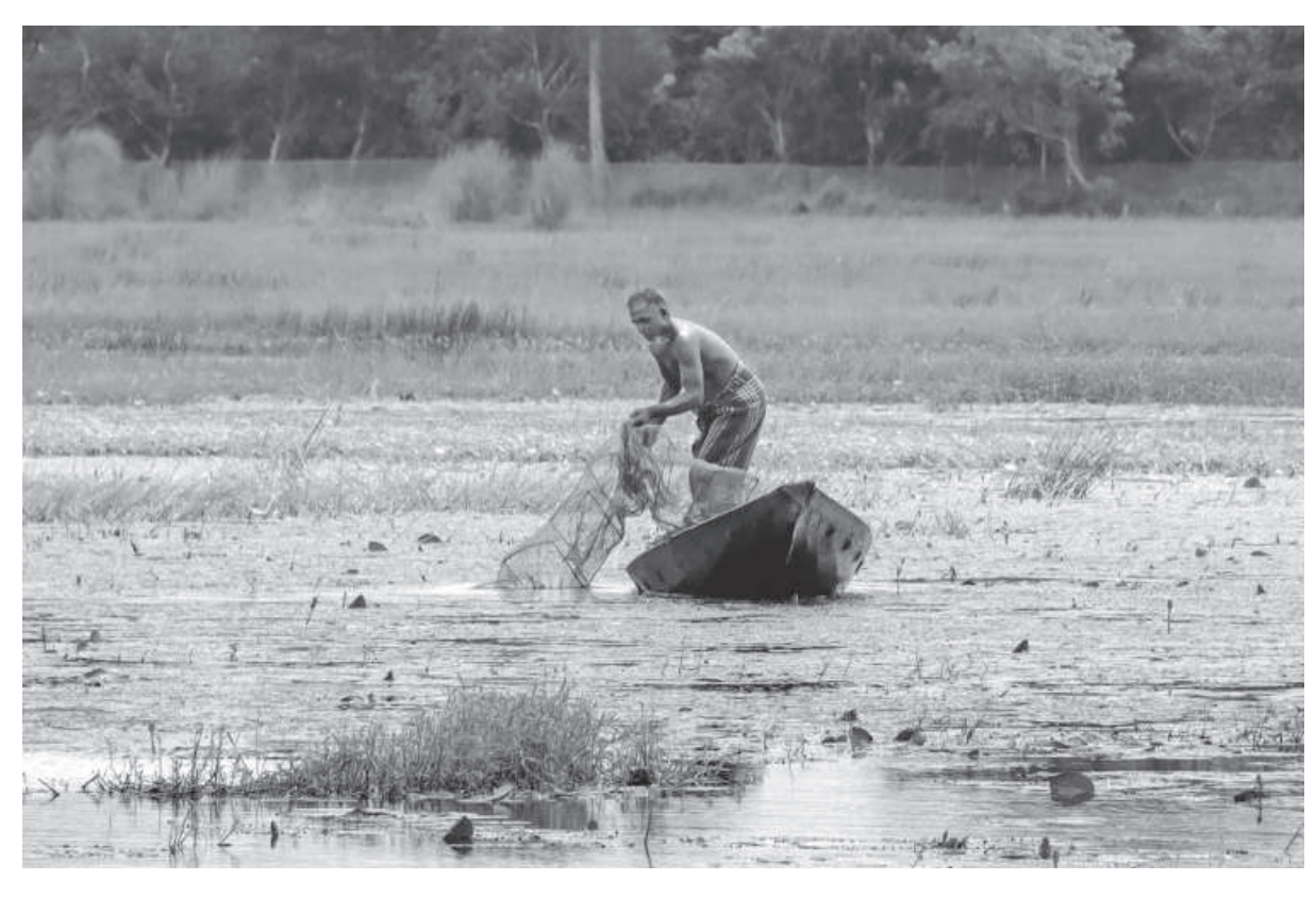
Using nets, a man catches fish at a nearby marshland. Like him, others are also involved in fishing there. They net a variety of fish including shoal, koi and bele from the marsh and earn around Tk 400-600 after selling those at local markets. The photo was taken near Joyrabad in Jashore yesterday.

The school head teacher Morshed filed a case yesterday evening. Police are investigating the incident, the OC