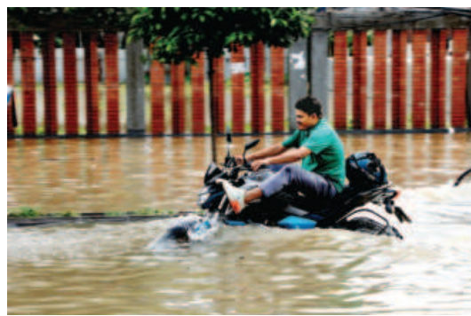
After Thursday night's downpour, areas of the city like (clockwise from left) Nilkhet, New Market and Chandni Chowk Market were still suffering from the after-effects yesterday. While some found innovative methods to traverse the waters, others were left cleaning up the mess it left behind.