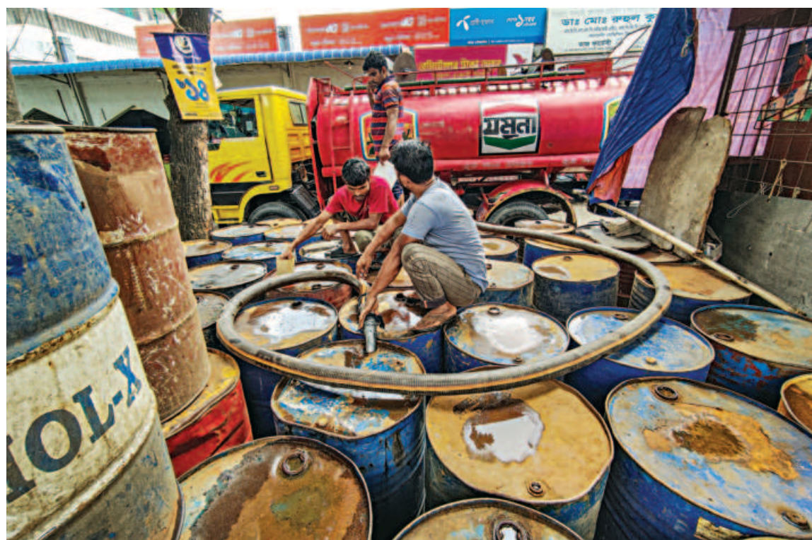
A local wholesaler fills multiple oil barrels with kerosene, stocking up in fear of rising prices. Storing such massive amounts of flammable substances on an open road is illegal and can be dangerous. The photo was taken in Tejaon colony bazar recently.