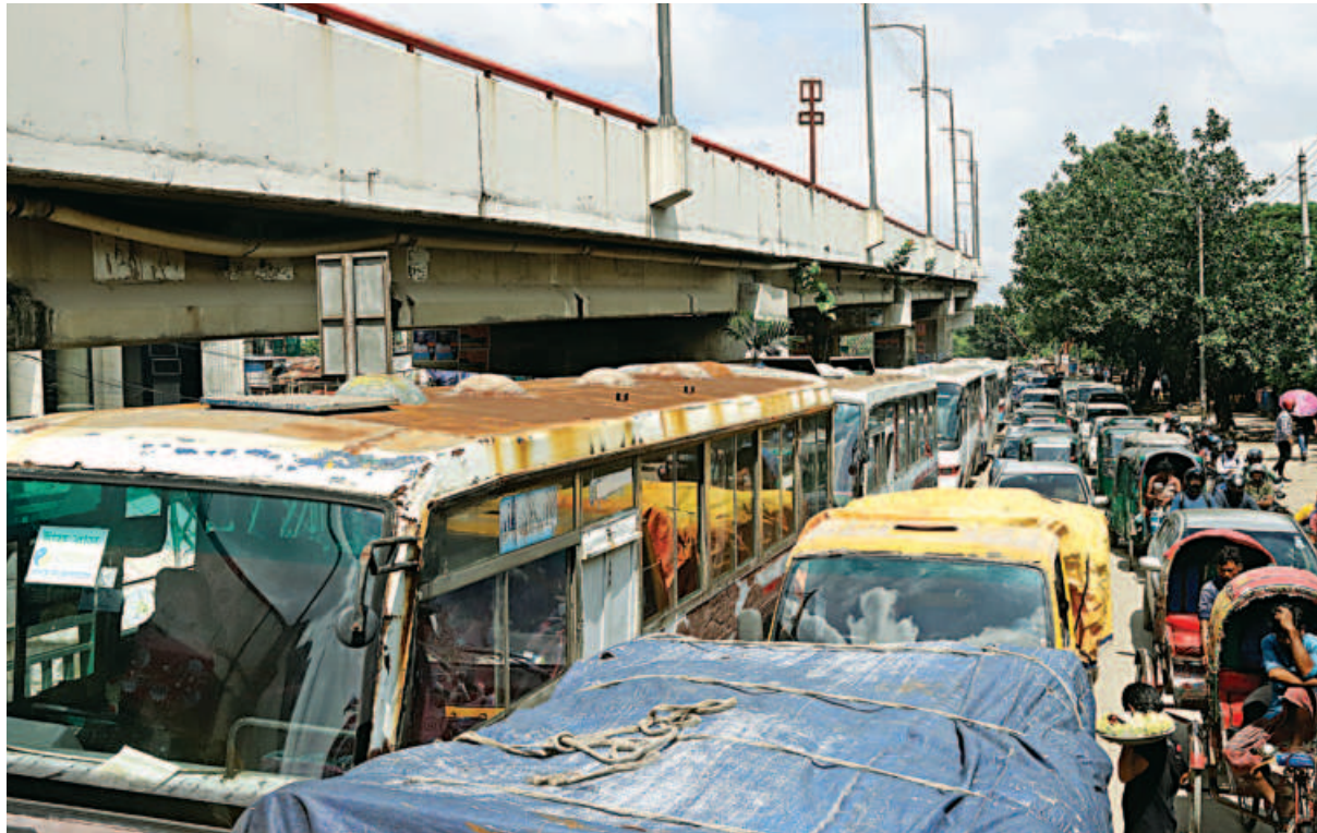
With parked staff buses taking up the fast lane of Panthapath-Tejgaon Link Road, vehicles are caught in a long tailback near the Pan Pacific Sonargaon hotel. Commuters suffer due to such snarl ups in the area. The photo was taken around 1:30pm yesterday.