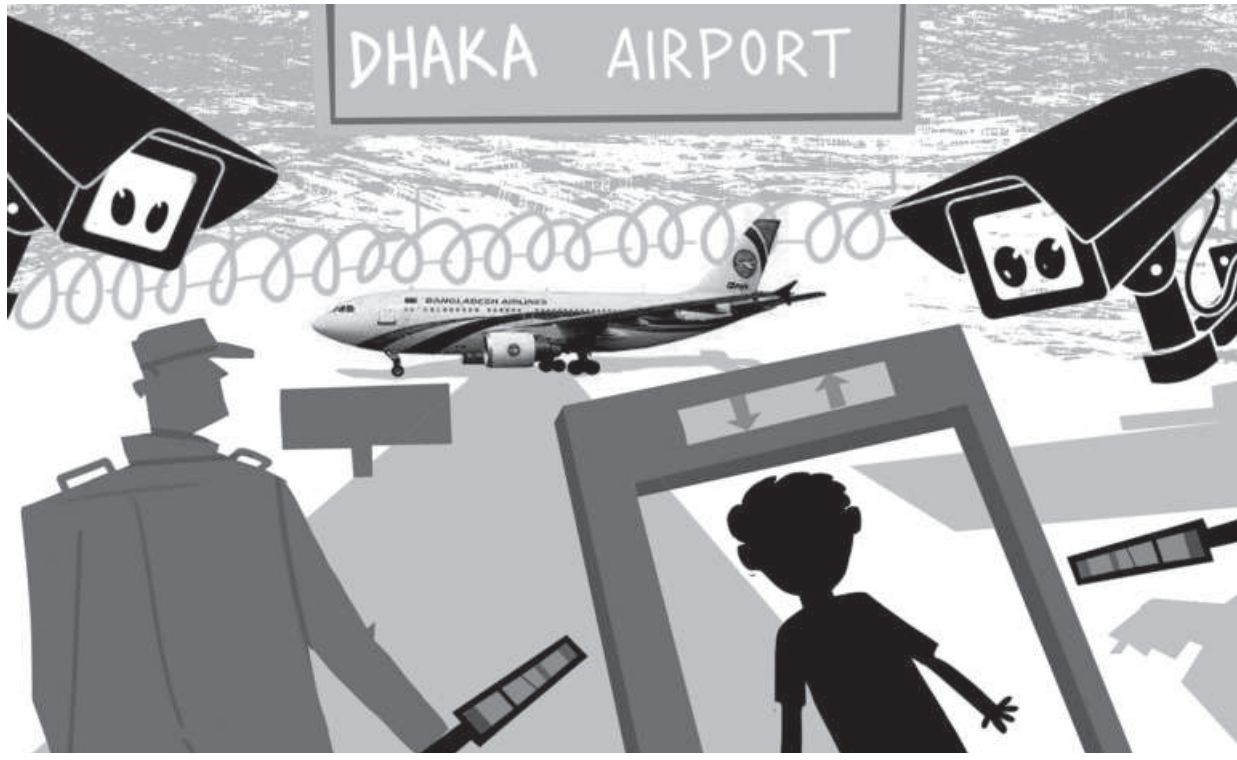
ILLUSTRATION: BIPOB CHAKROBORTY