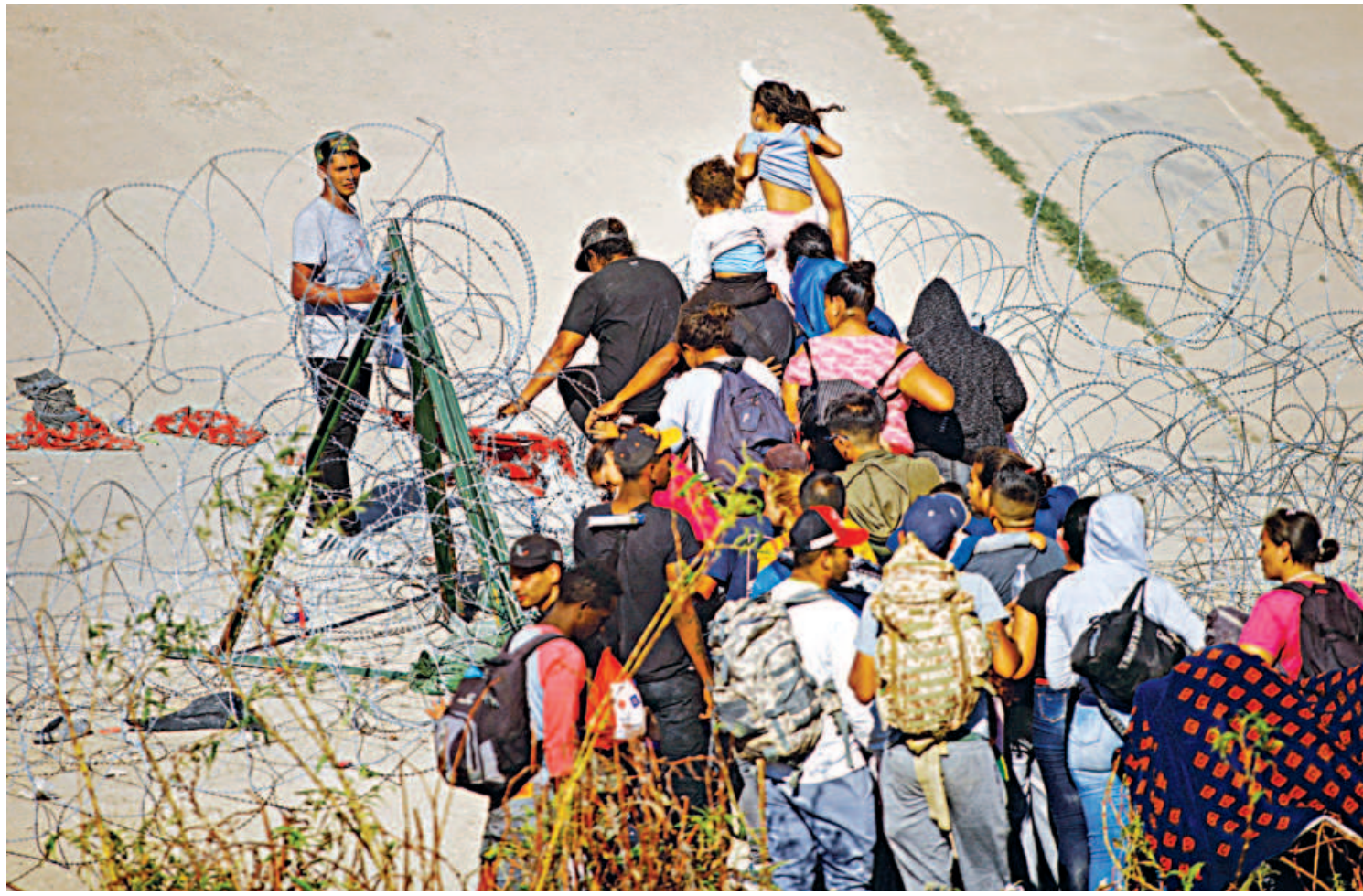
Migrants seeking asylum in the United States try to cross a razor wire fence deployed to inhibit the crossing of migrants into the United States, near a border wall on the banks of the Rio Bravo River, on the border between the US and Mexico, as seen from Ciudad Juarez, Mexico on Monday.

Days before that visit, the ICC issued a warrant for Putin's arrest on suspicion of illegally deporting hundreds of children from Ukraine.