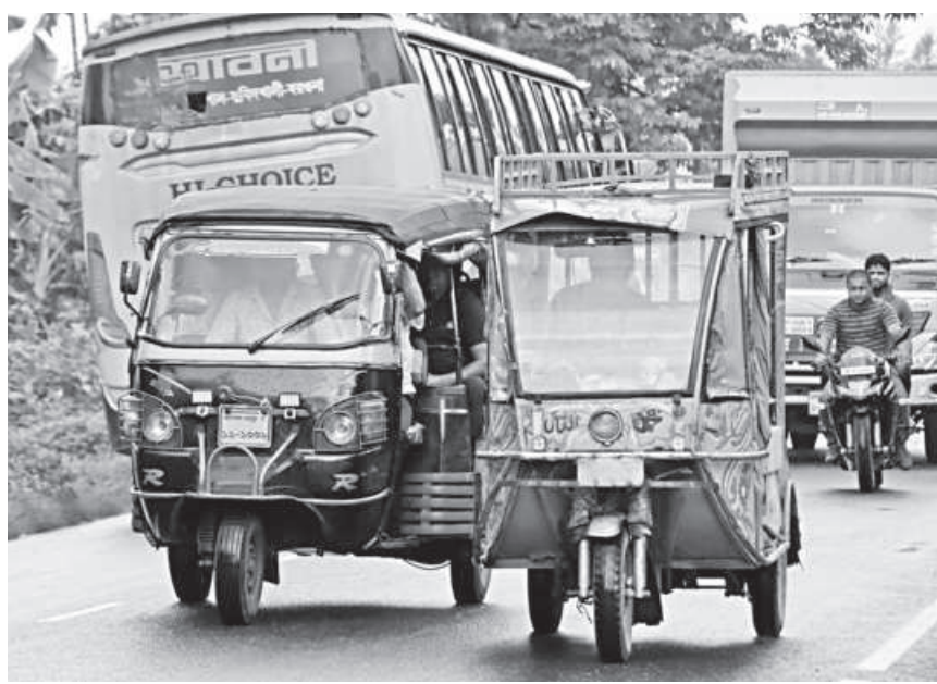
Defying ban, three-wheelers continue to ply Dhaka-Barishal highway. These slow-moving vehicles often escalate the risk of accidents. The photo was taken yesterday.