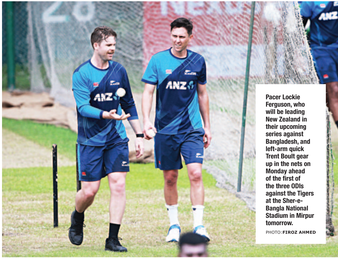
Pacer Lockie Ferguson, who will be leading New Zealand in their upcoming series against Bangladesh, and left-arm quick Trent Boult gear up in the nets on Monday ahead of the first of the three ODIs against the Tigers at the Sher-e-Bangla National Stadium in Mirpur tomorrow.