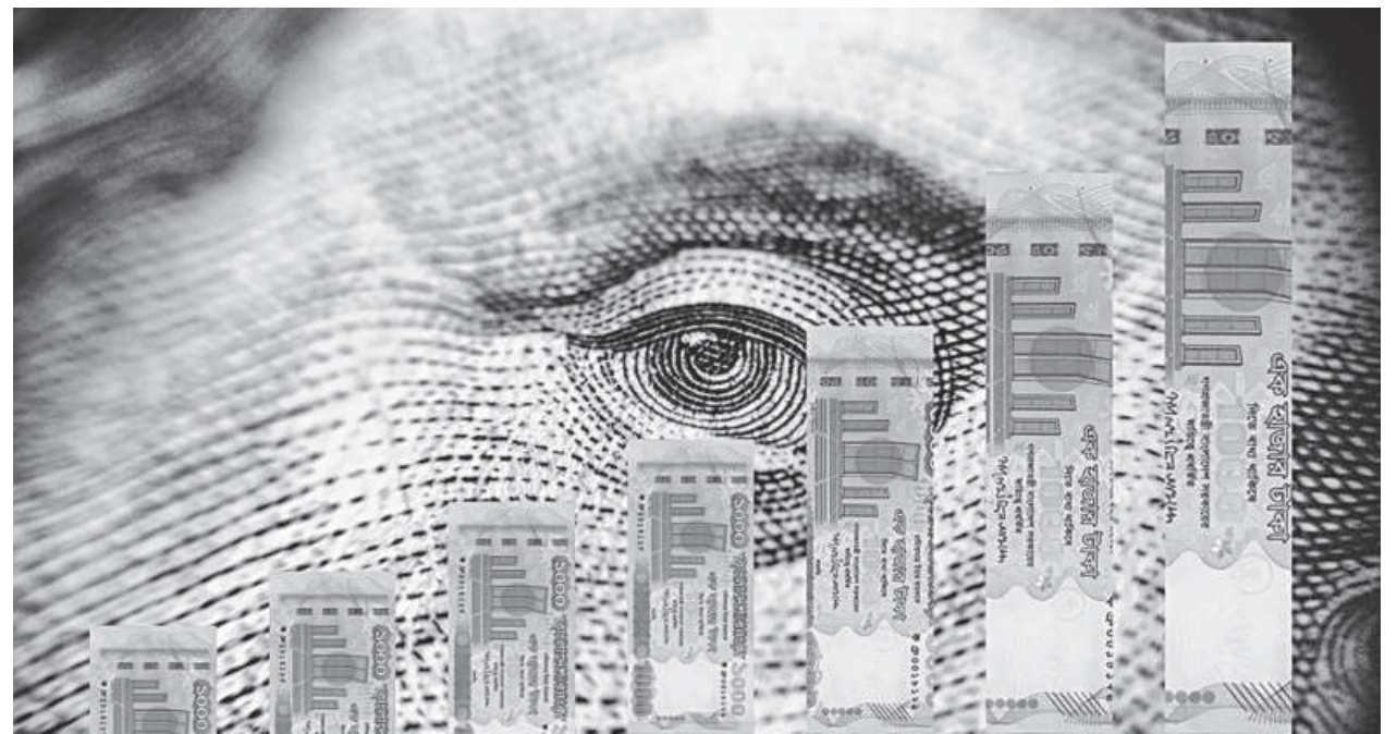
VISUAL: TEENI AND TUNI

There are three reasons why BB is not catching up with the actual price of the dollar: 1) fear of inflation; 2) fear of excessive volatility of the exchange rate; and 3) the typical mentality of making taka's depreciation equivalent to the economic weakness of the regime. The theory suggesting that a higher dollar price will stoke inflation further through the import channel is partly true. But the main inflation, which makes the poor suffer the most, is originating from the high prices of necessities, which do not relate to import channels as much. Inflation remains stubbornly high because of incorrect policy rates and fiscal incapacity. The finance ministry failed to collect taxes from the superrich and resorted to making the central bank print extra notes. This