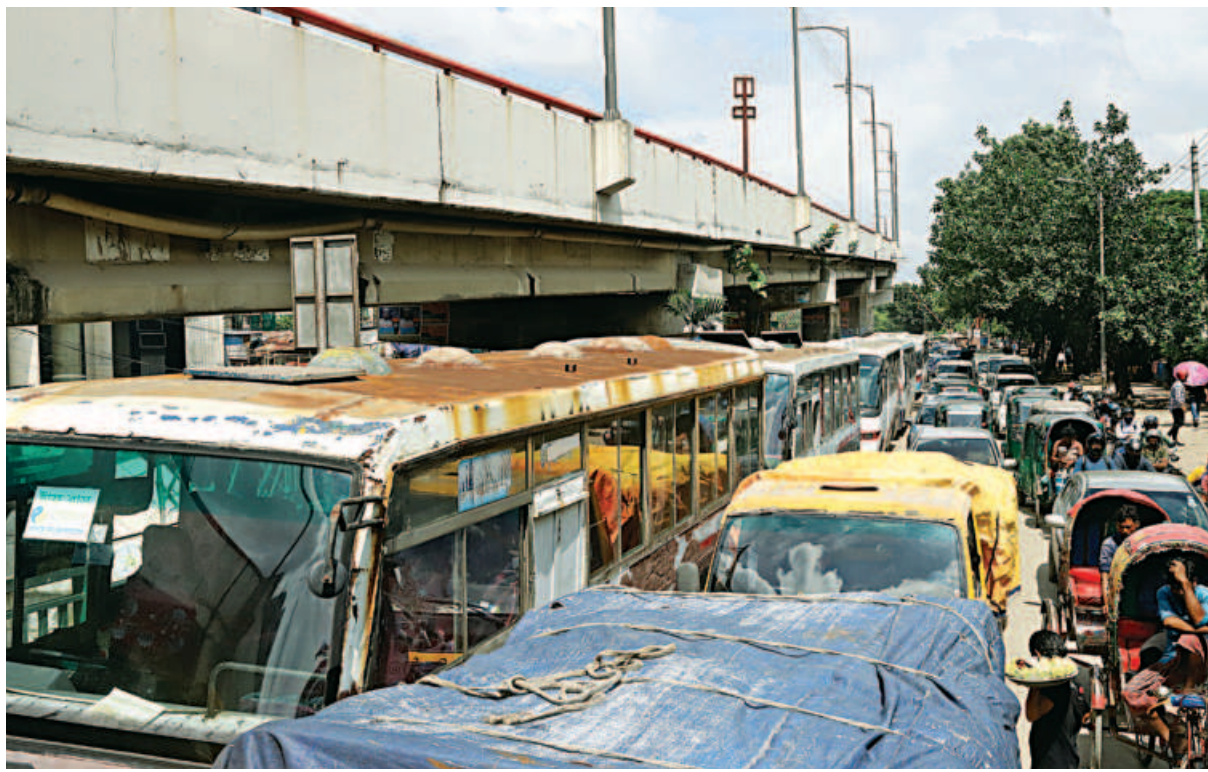
With parked staff buses taking up the fast lane of Panthapath-Tejgaon Link Road, vehicles are caught in a long tailback near the Pan Pacific Sonargaon hotel. Commuters suffer due to such snarl ups in the area. The photo was taken around 1:30pm yesterday.