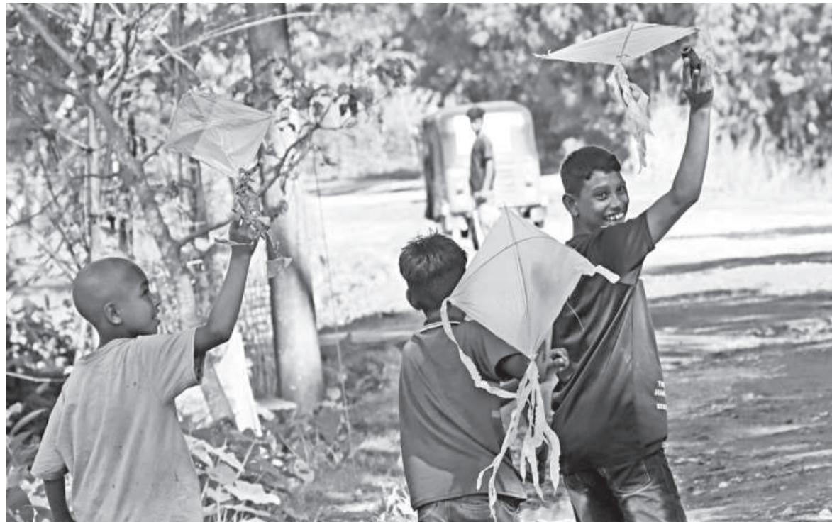
Three boys, holding kites made from used polythene bags, race against the wind as the country welcomes autumn. The photo was taken yesterday in Sylhet Sadar's Umairgaon area.