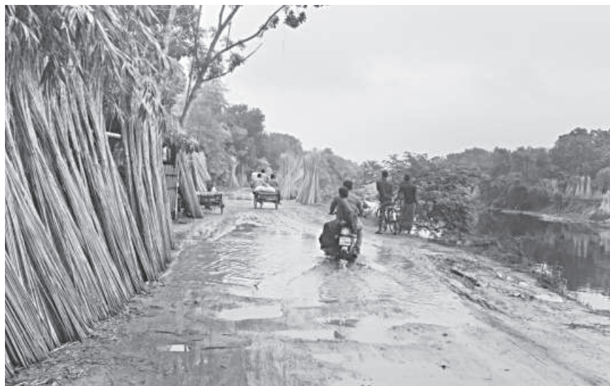
Vehicles ply a pothole-ridden road clogged with rainwater in Baliadangi, Rajbari. Such a situation has been prevailing for three years. The photo was taken recently.

Its leaders also threatened to wage a tough movement if miscreants are not arrested immediately.