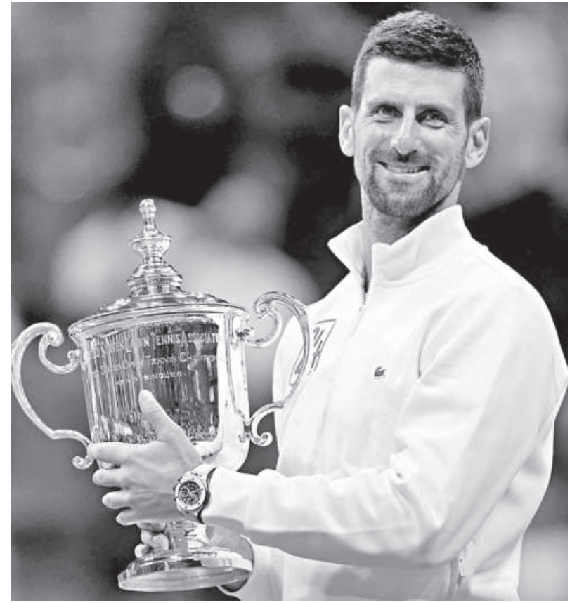
Novak Djokovic celebrates after defeating Daniil Medvedev in the 2023 US Open men’s singles final.

In the semifinals, he confronted America’s rising star, Ben Shelton, with the unforgiving crowd at Flushing Meadow solidly behind their fellow countryman. Shelton’s exuberant celebrations at every point began to get on Djokovic’s nerves.