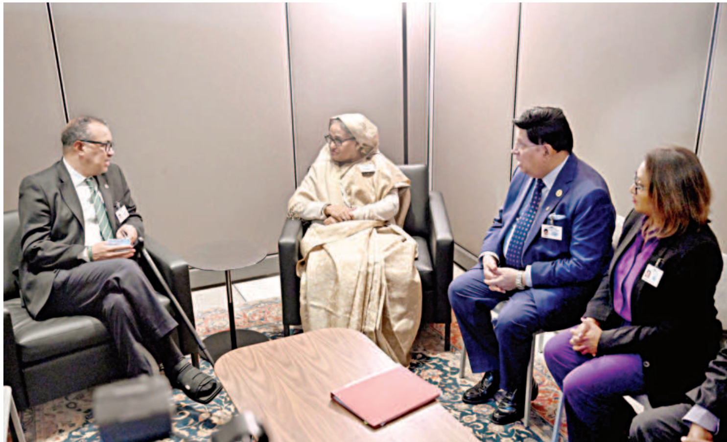
Prime Minister Sheikh Hasina at a meeting with WHO Director General Tedros Adhanom Ghebreyesus at the United Nations Headquarters in New York on Monday. The premier is in the US to attend the 78th session of the UN General Assembly.