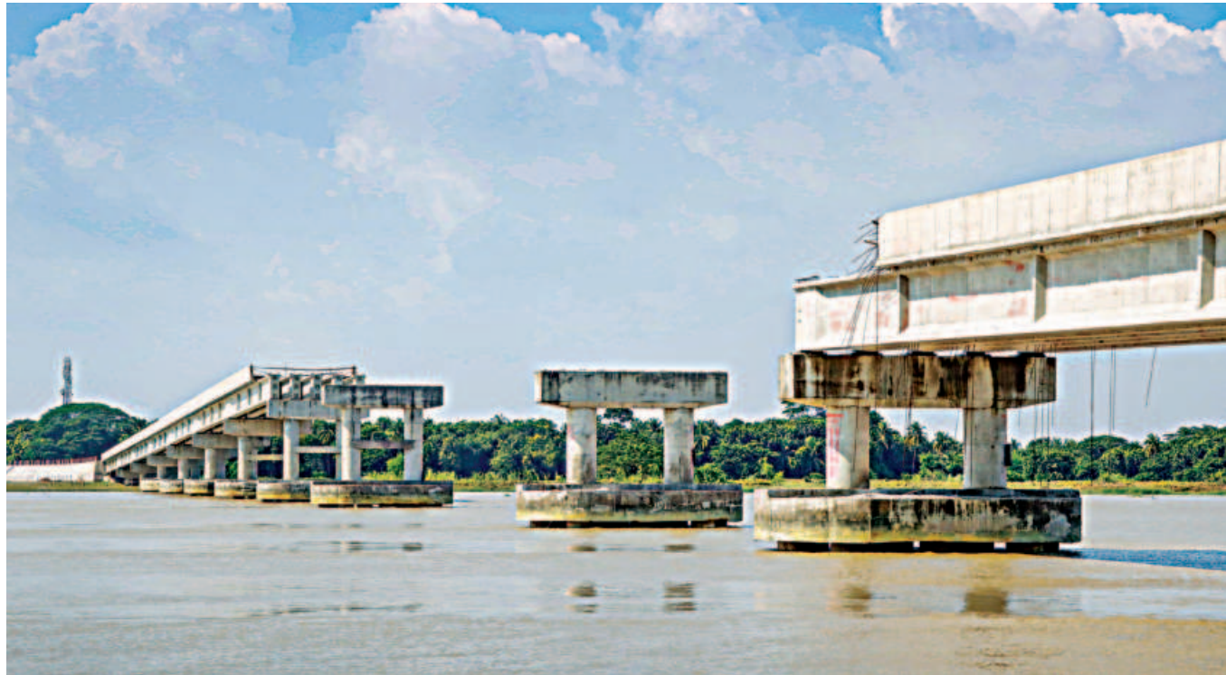
Construction of the Kalia Bridge over the Nabaganga river in Narail's Kalia upazila is yet to be completed. The first deadline for completion expired in June 2019. Officials attributed the delay mainly to a design flaw. Residents of the upazila still use trawlers and ferries to travel to Narail town. The photo was taken recently.