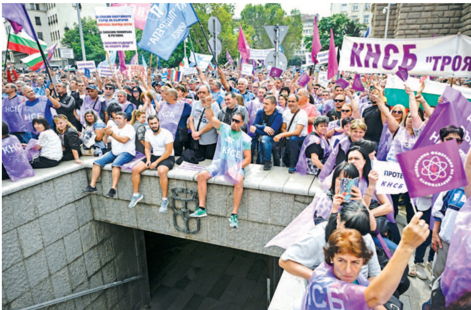
Miners and members of Bulgaria's trade unions attend a protest demanding for a clear and secure energy future of Bulgaria in front of Bulgarian Parliament in Sofia yesterday.