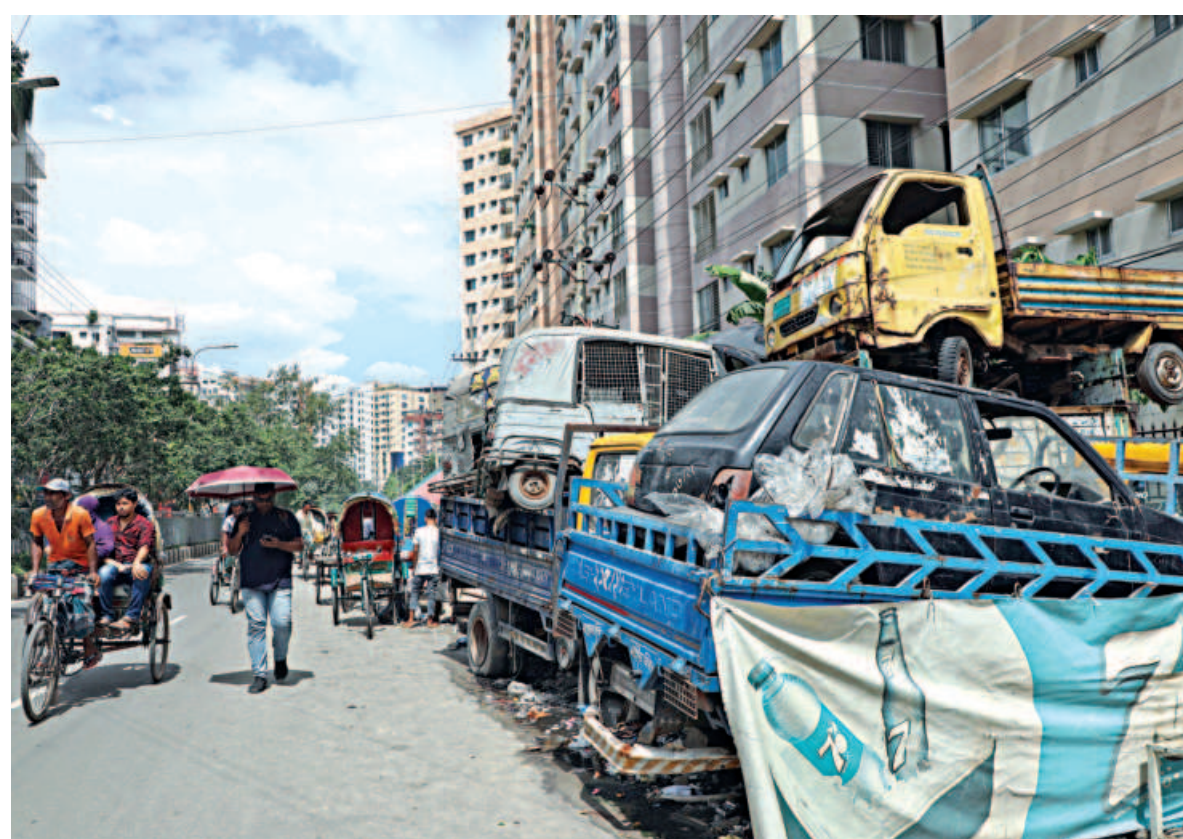
Piles of seized pick-up vans, cars, and CNG-run three-wheelers left to decay on a footpath of Shyamoli Ring Road in the capital. Such mindless action not only obstruct pedestrian movement, but also can lead to accidents. The photo was taken yesterday.