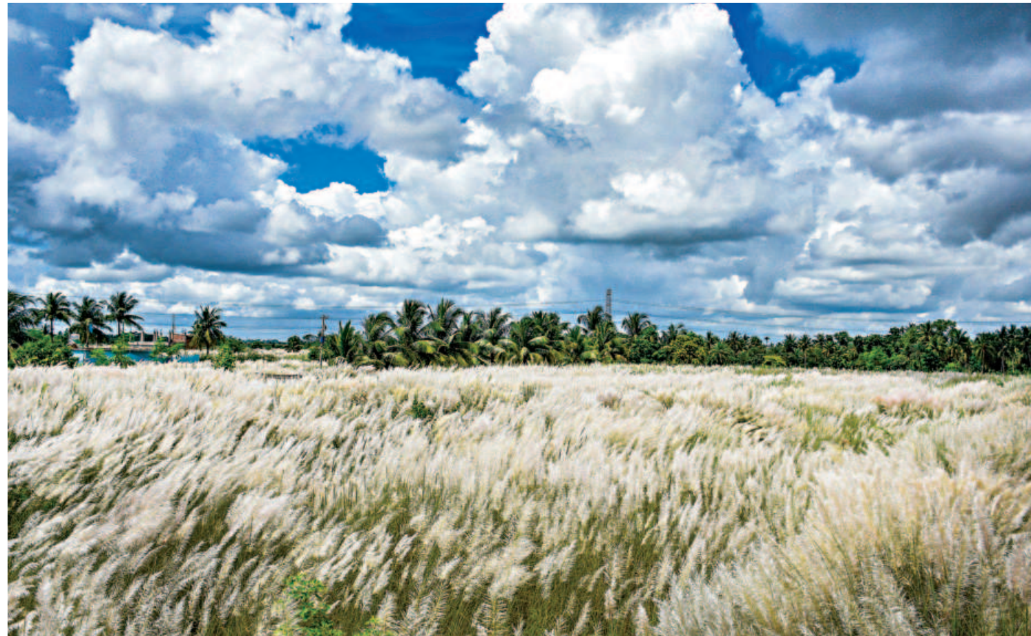
WELCOMING AUTUMN ... When "sharat" starts in the month of Ashwin, it's almost like the clouds descend as Kans grass flowers, known as Kanshful, spread through the lands. Against the blue sky, the flowers sway with the autumn winds, providing an amazing spectacle for all. The photo was taken at Khulna's Dumuria upazila area yesterday.