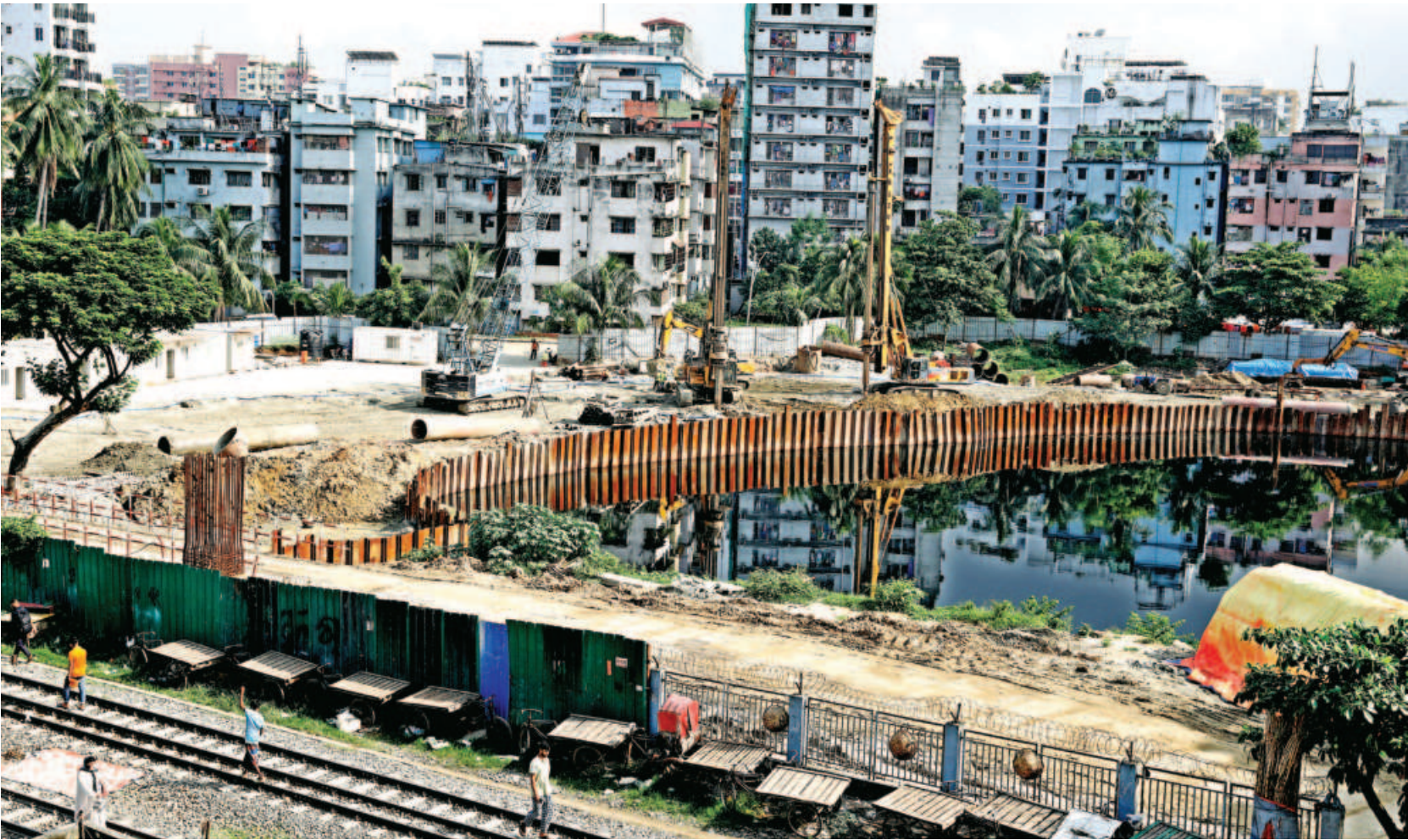
To make room for the Dhaka Elevated Expressway, this part of Hatirjheel has been filled up near the Pan Pacific Sonargaon hotel. The expressway will link Shahjalal International Airport and the Dhaka-Chattogram highway. The airport-Farmgate section of the expressway has been opened recently. The photo was taken yesterday.