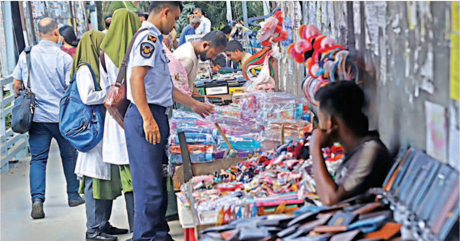
Pedestrians struggle to find a way ahead as vendors occupy a significant portion of the footbridge at the capital's Farmgate. The photo was taken yesterday.