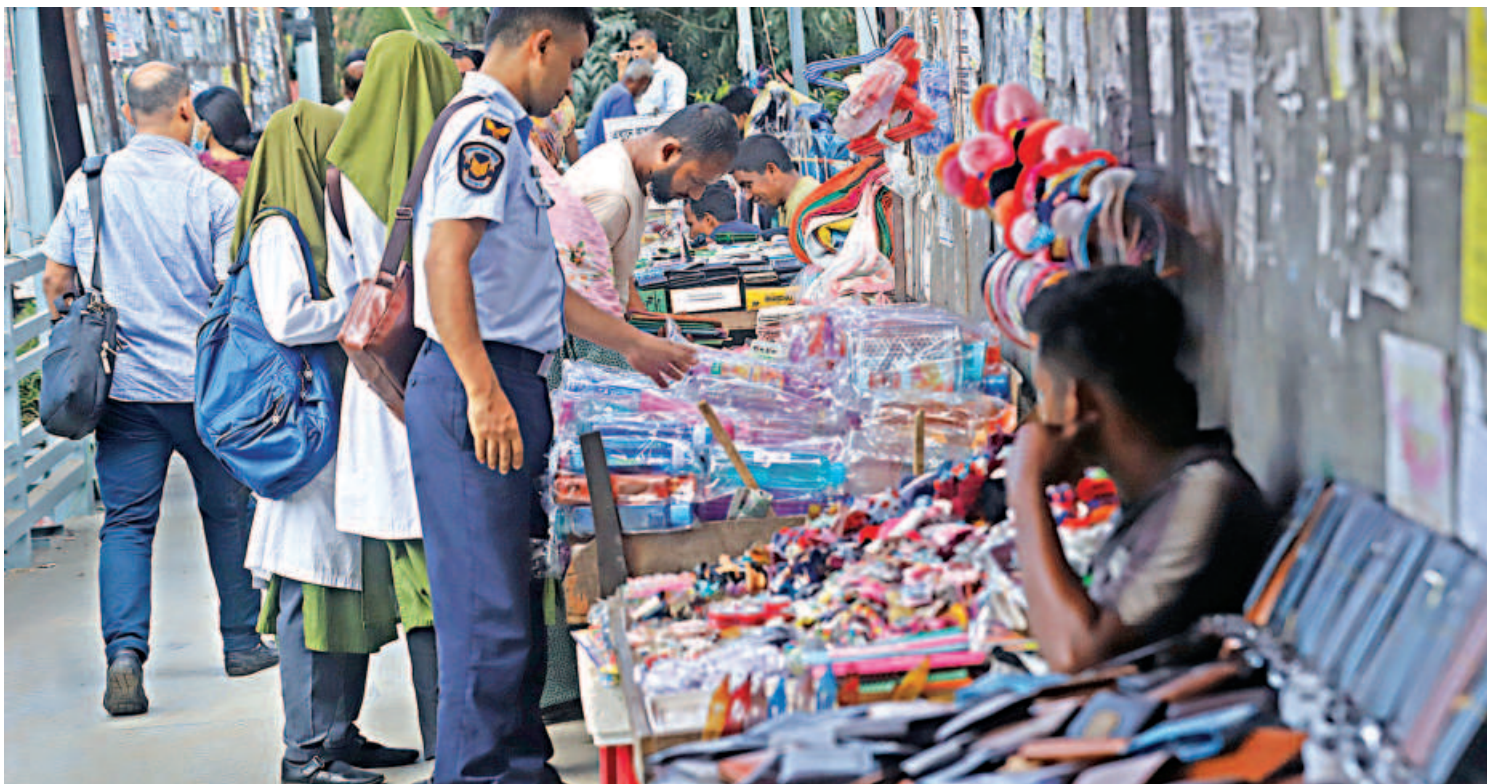
Pedestrians struggle to find a way ahead as vendors occupy a significant portion of the footbridge at the capital's Farmgate. The photo was taken yesterday.