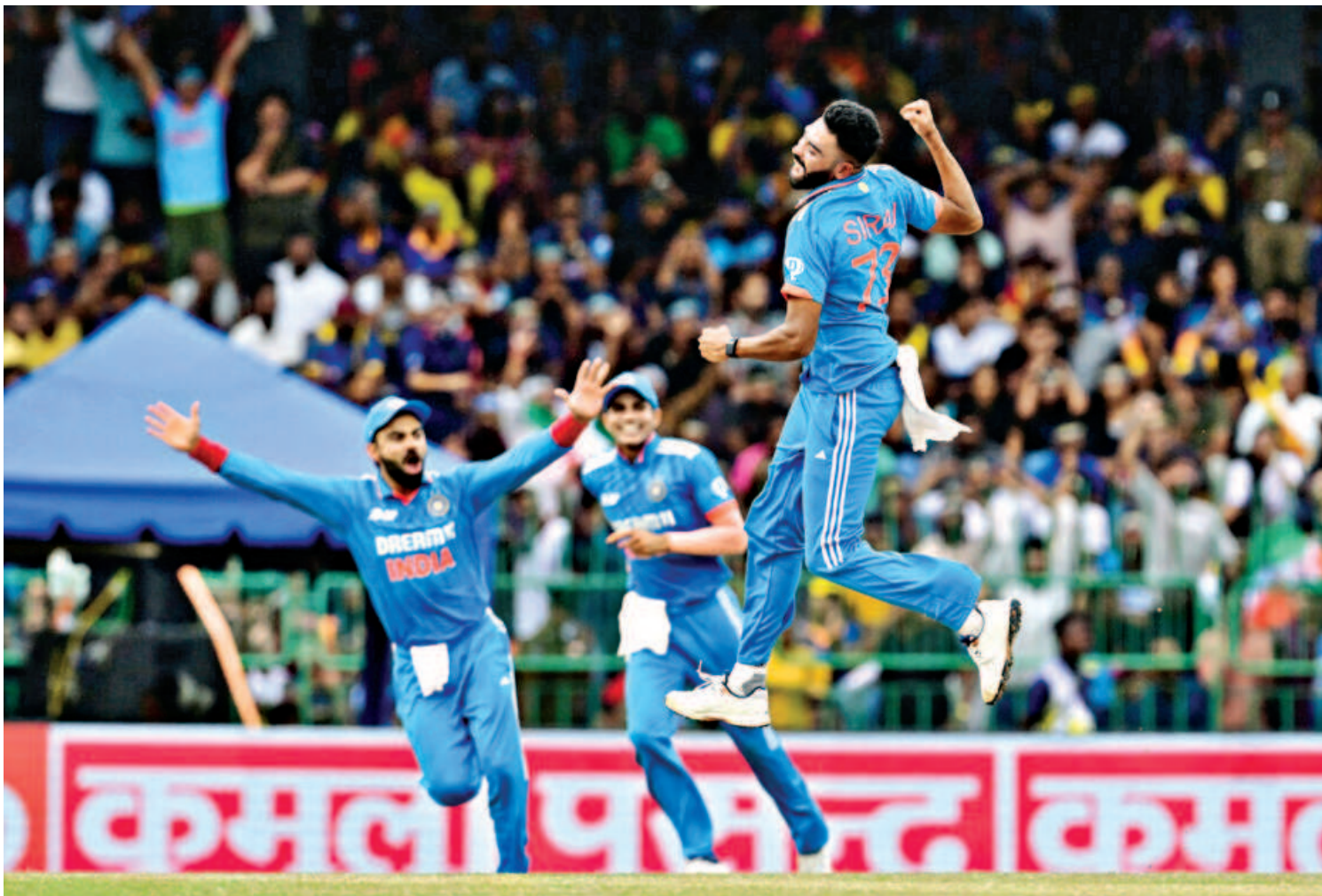
Mohammed Siraj jumps in the air as Virat Kohli and Shubman Gill join in celebration following one of his six wickets during India's 10-wicket victory over Sri Lanka in the final of the Asia Cup at the R Premadasa Stadium in Colombo yesterday.