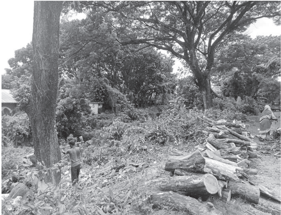
Workers with axes in their hands, relentlessly felling towering trees, as part of a Roads and Highway Department project to ‘ensure highway safety’. The fallen giants, now lifeless logs, are then being transported away with trucks, an act that sparked widespread criticism from environmentalists and locals.