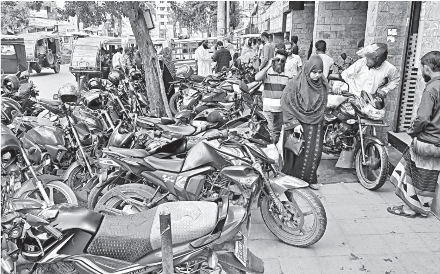
An array of parked motorbikes on a footpath in front of Gazi Medical College and Hospital leads to pedestrians’ woes, especially for patients. The photo was taken yesterday on Majid Sarani in Khulna city’s Shonadanga area.