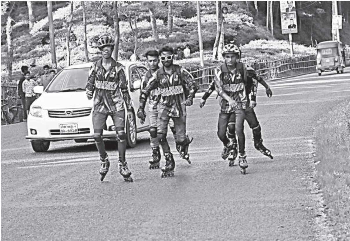
Skating has become popular among the young people of Sylhet who are often seen enjoying the sport in groups, especially during weekends. However, due to a lack of facilities, skaters have to take to the streets among speeding vehicles which poses a serious risk of accidents. The photo was taken on the city's Airport Road recently.