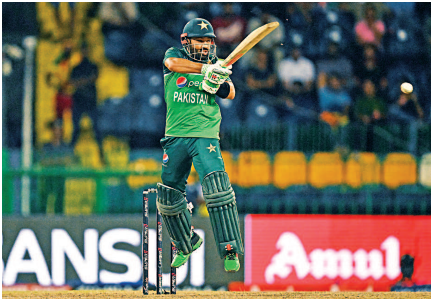
Mohammad Rizwan scored an unbeaten 86 off 73 deliveries and stitched together a crucial 108-run sixth-wicket stand with Iftikhar Ahmed to see Pakistan post a total of 252 for seven in 42 overs in their rain-interrupted Asia Cup Super Four game against Sri Lanka in Colombo yesterday. The winner of the contest will face India in the final on Sunday.