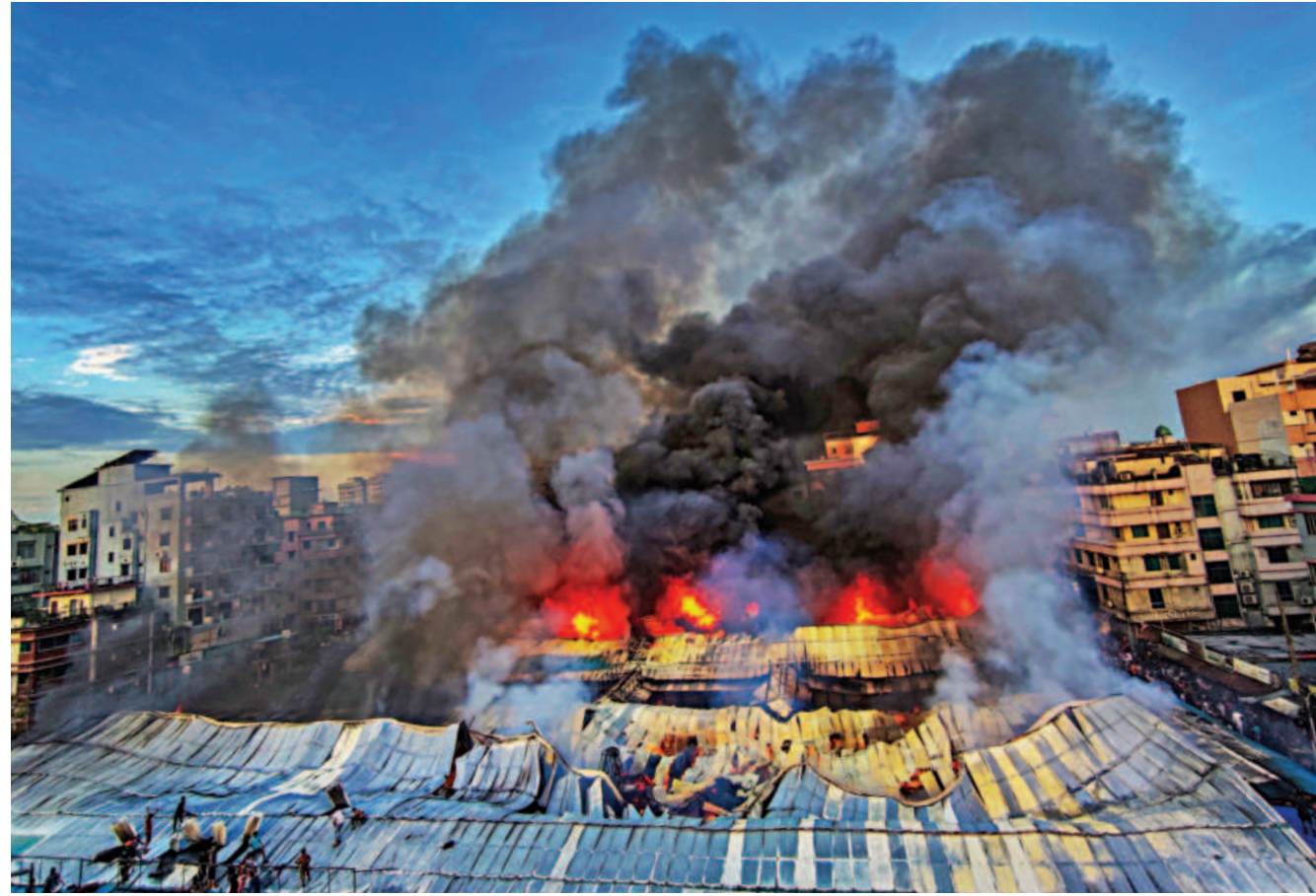
Huge plumes of smoke rise as a fire rages at Mohammadpur Krishi Market in the capital. Over 200 shops were damaged yesterday by the fire that started before dawn broke.