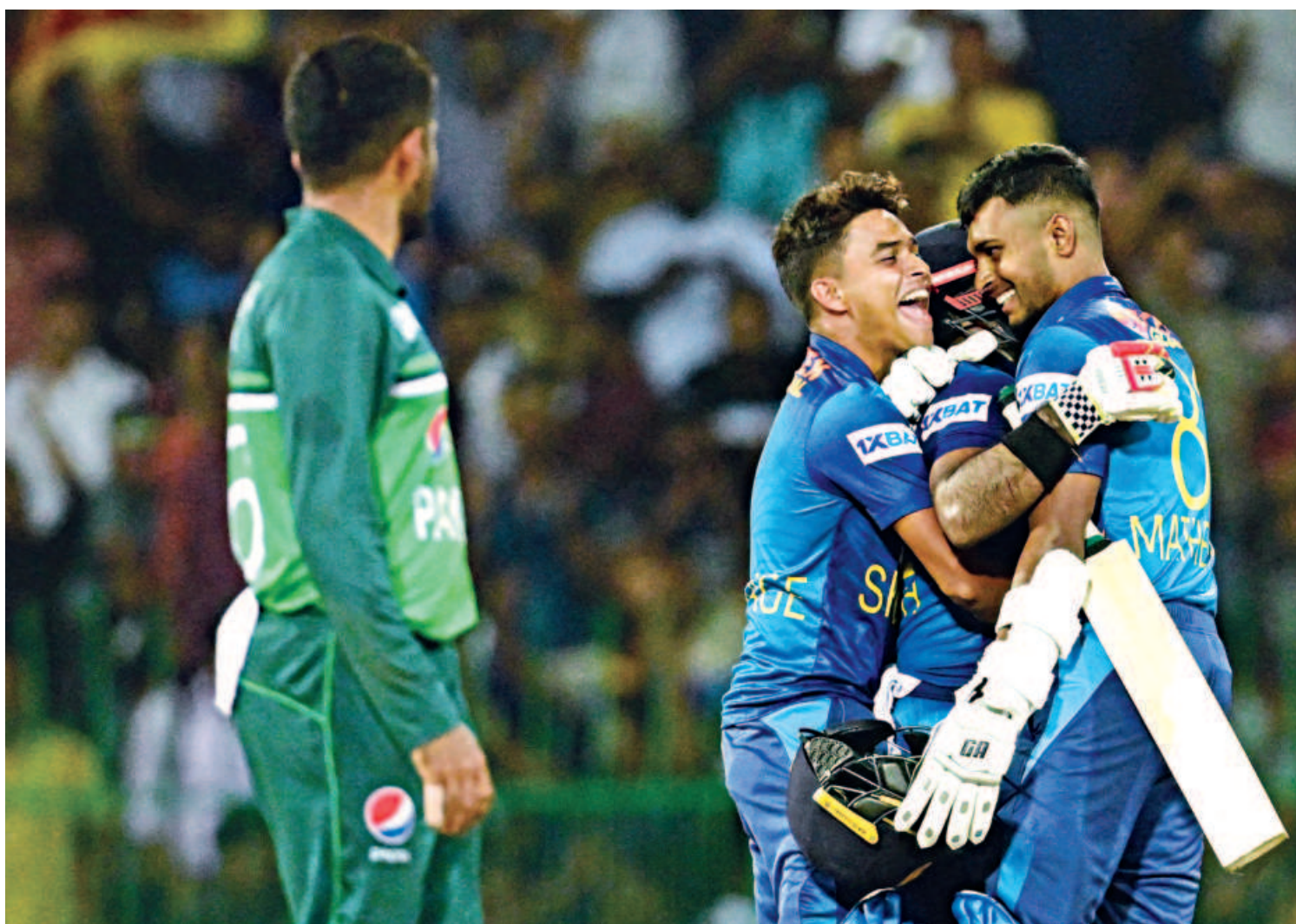
A nail-biting affair decided in the last delivery saw Sri Lanka reach the Asia Cup final as they ultimately won the battle of nerves against Pakistan to earn a two-wicket victory in a Super Four match at the R. Premadasa Stadium in Colombo yesterday.