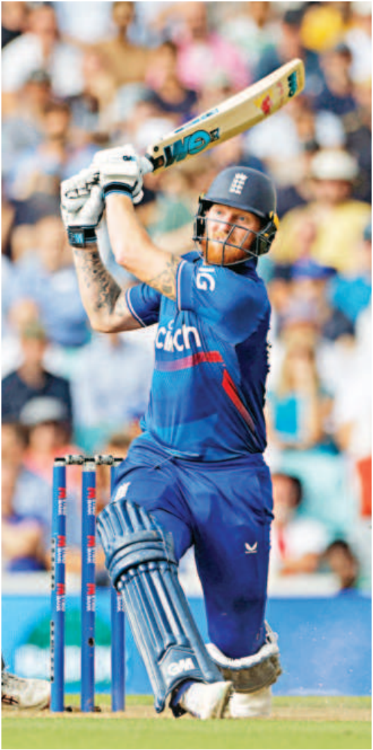
England batter Ben Stokes smashes one during his record-breaking 182-run knock off 124 deliveries against New Zealand during the third ODI at The Oval in London yesterday. The innings featuring 15 fours and nine sixes helped Stokes set the highest individual ODI innings by an English player, beating the previous record of 180 runs by Jason Roy against Australia in 2018 as England posted 368 all out in 48.1 overs.

AFP, Kabul Afghanistan recalled fast bowler Naveen-ul-Haq in the 15-man World Cup squad announced Wednesday, but allrounder Gulbadin Naib was dropped despite recent good performance. Naib, 32, led Afghanistan in the last World Cup held in England four years ago where the team lost all nine matches and he was sacked. But the medium pacer took seven wickets in the last three ODIs, including 4-60 against Bangladesh in the Asia Cup encounter in Lahore last week. Naveen played the last of his seven ODIs against Ireland in January 2021. Hashmatullah Shahidi leads the squad that has four changes following a two-match loss in the Asia Cup and a 3-0 series wipe out against Pakistan in Sri Lanka. Besides Naib, also out are Karim Janat, Sharafuddin Ashraf and Suliman Safi.