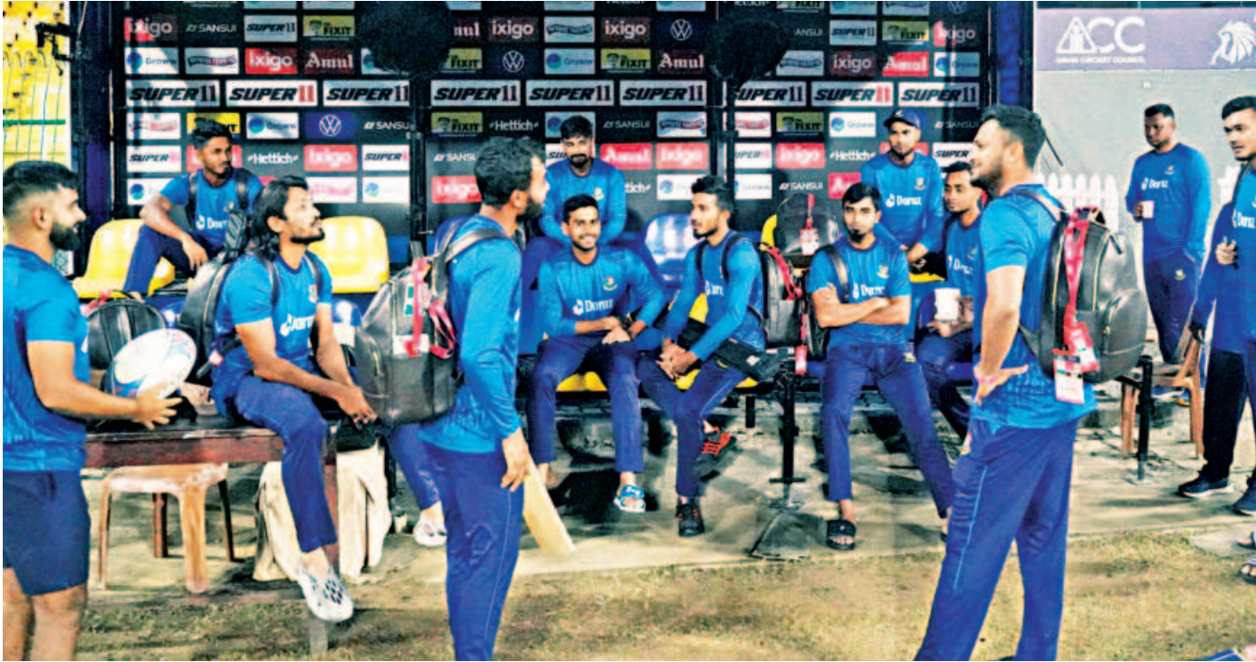
Bangladesh captain Shakib Al Hasan speaks to his teammates following a training session in Colombo yesterday, the day after reaching the Sri Lanka capital following a three-day leave for a visit to Dhaka. Bangladesh, already out of contention for the Asia Cup final, will play their last game on Friday against India, who have already booked a final spot.