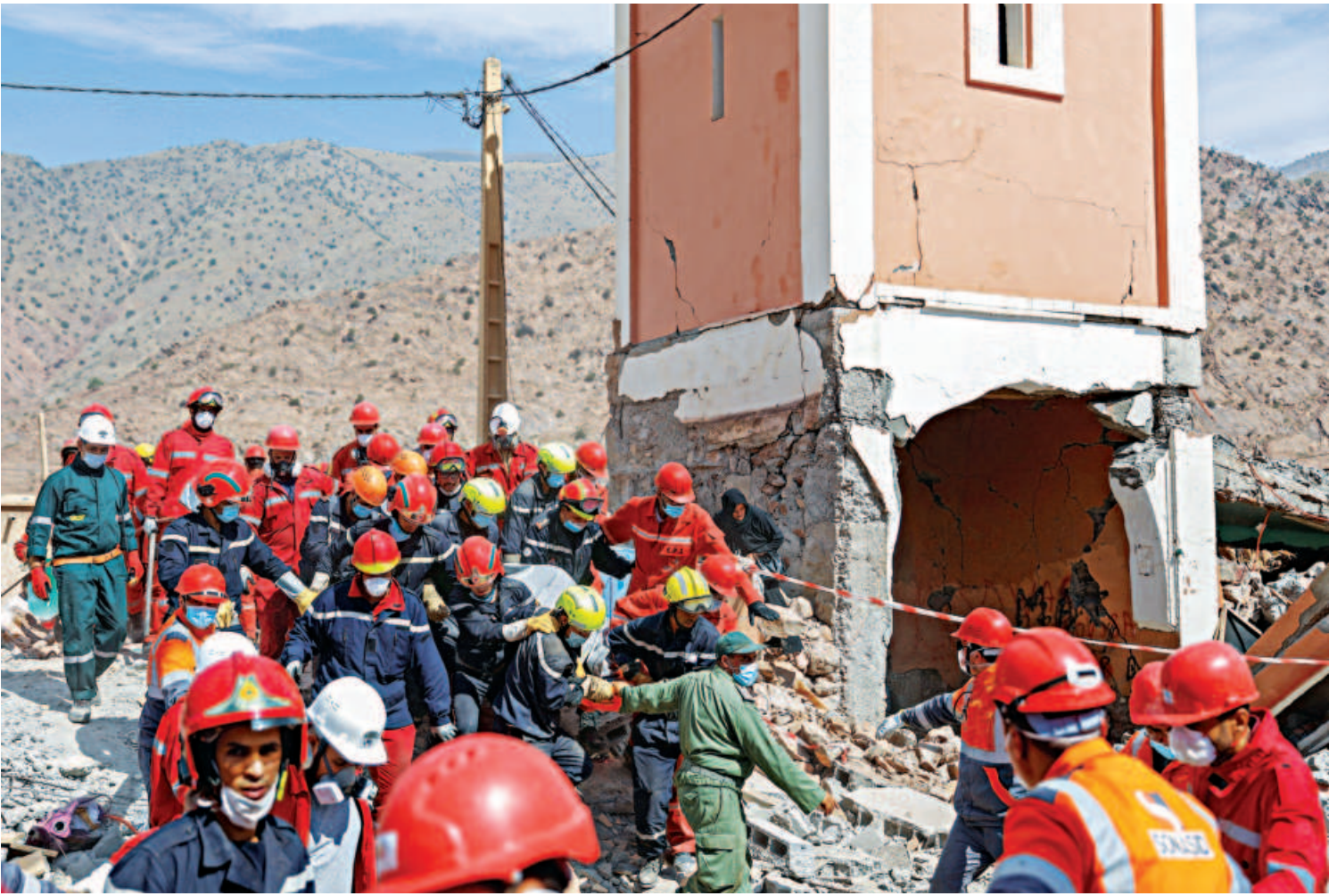
Rescue workers carry a body recovered from under the rubble in the aftermath of a deadly earthquake in Talat N'Yaaqoub, in Morocco yesterday.

Republican US House of Representatives Speaker Kevin McCarthy yesterday called for an impeachment inquiry into Democratic President Joe Biden encouraged by his party’s right flank - a move certain to further divide lawmakers as they struggle to passing legislation to avoid a government shutdown. “I am directing our House committees to open a formal impeachment inquiry into President Joe Biden,” McCarthy told reporters. Many in McCarthy’s party were infuriated when the House, then controlled by Democrats, twice impeached Republican President Donald Trump - in 2019 and 2021 - though he was acquitted both times in the Senate. Biden, who defeated Trump in the 2020 election, is seeking re-election next year. Republicans, who now narrowly control the House, have accused Biden of profiting while he served as vice president from 2009 to 2017 from his son Hunter Biden’s foreign business ventures, though they have not presented substantiation.