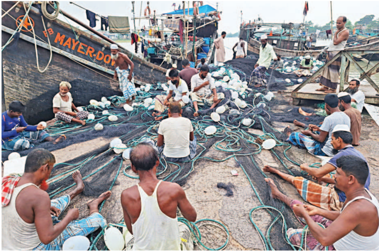
Fishermen repair their nets before heading out to catch hilsa in the Bay of Bengal. A huge number of unskilled and low-skilled workers are struggling to meet their living expenses as their wage growth has remained below the inflation rate for the past 19 months. The photo was taken at the Mahipur fish landing station in Kalapara upazila of Patuakhali yesterday.