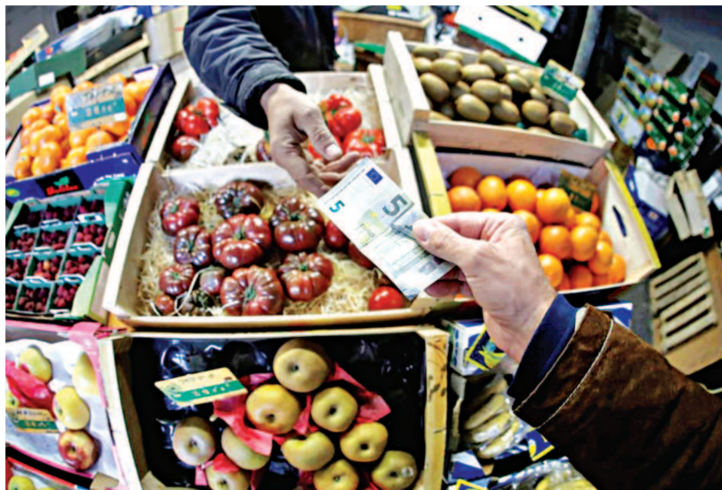
A shopper pays with a euro bank note in a weekly market in Nice, France.