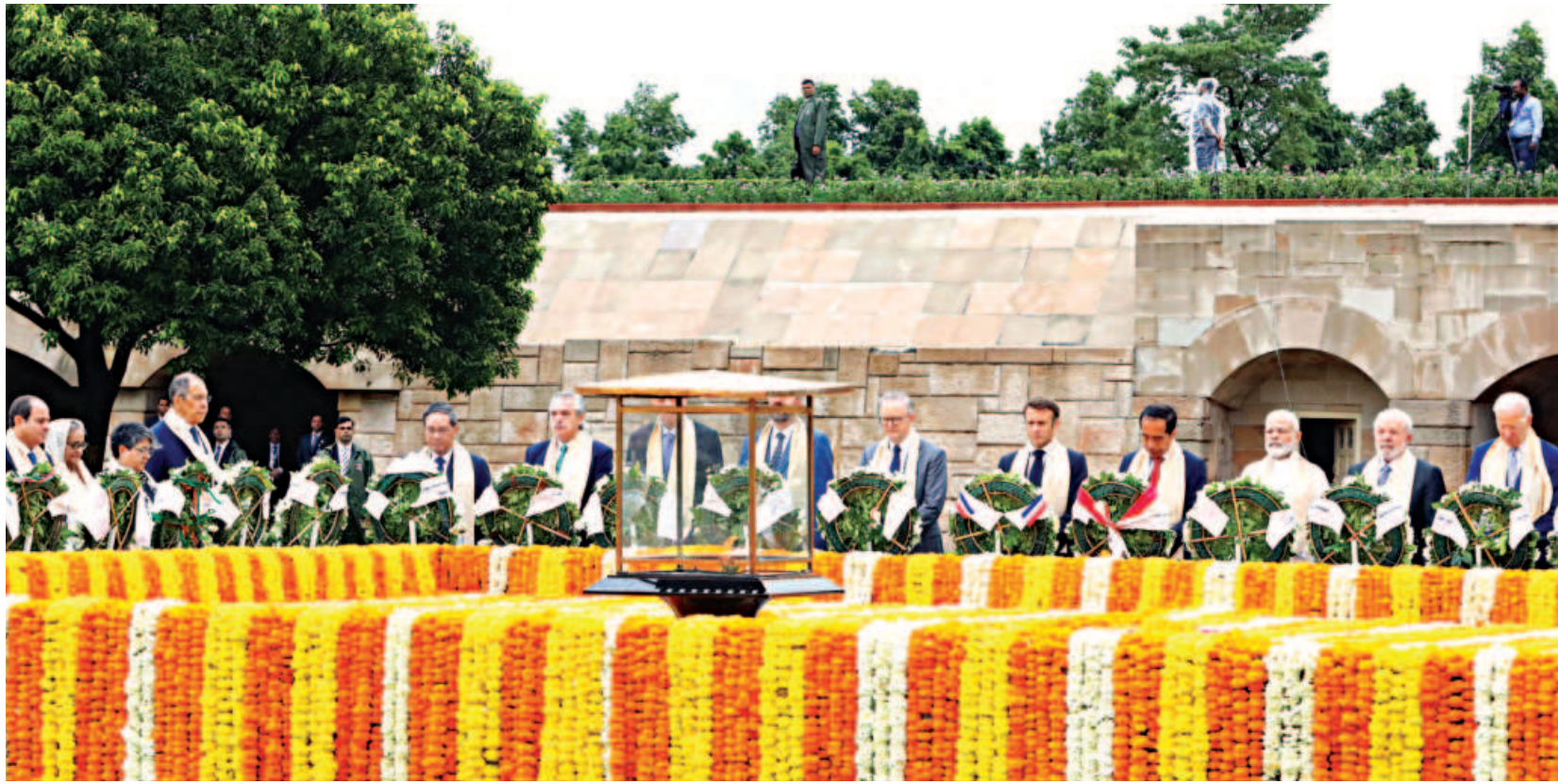
Prime Minister Sheikh Hasina, along with other world leaders, including Indian Prime Minister Narendra Modi, French President Emmanuel Macron and US President Joe Biden, laying wreaths at Mahatma Gandhi's memorial in Delhi's Rajghat yesterday -- the concluding day of the G20 Summit held the Indian capital.