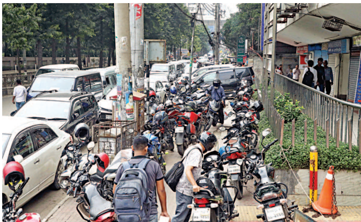
While parked motorcycles crowd the entire pavement in front of the TCB building in Karwan Bazar, the corresponding road is almost half occupied by multiple rows of illegally parked cars -- barring the movement of both pedestrians and vehicles. The photo was taken yesterday afternoon.