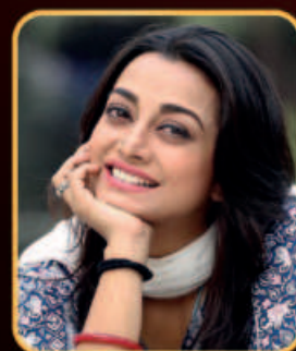
Nazia Haque Orsha

Dr Sabrina, who is subtle, calm, and reactive where necessary, is brilliantly portrayed by Mehazabien in Ashfaque Nipun's web-series Sabrina .