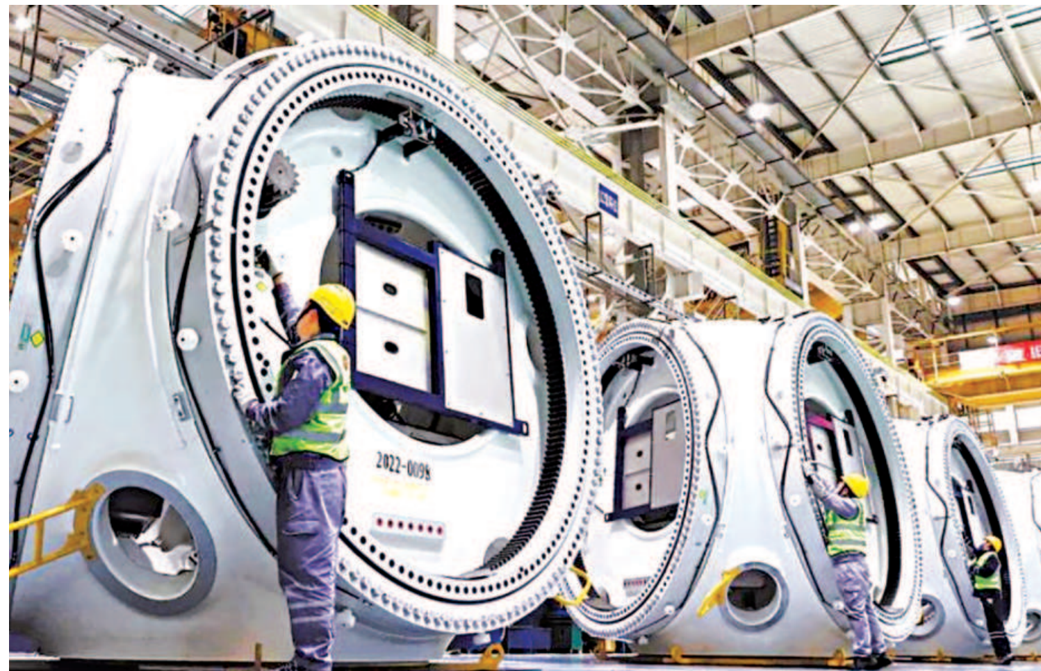
Workers assemble wind turbine wheels at a factory in Lianyungang Economic and Technological Development Zone in East China's Jiangsu province on Feb 28.

A property market downturn is seen as one of the key drags on domestic demand. The government has ramped up efforts to shore up the sector by lowering down payments and reducing the interest rates of new and existing mortgages, along with other measures to strengthen the broader economy, such as cutting stamp duty and personal income tax.