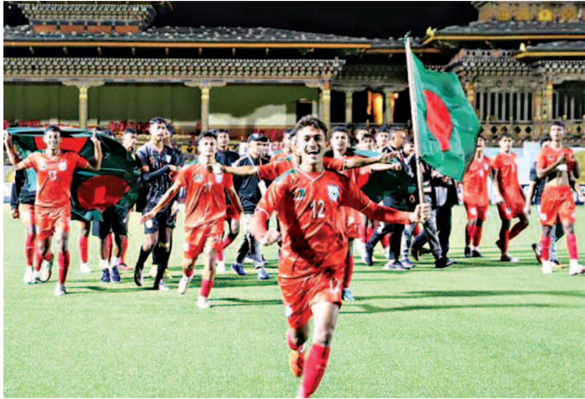
Bangladesh players celebrate their 2-1 victory over Pakistan in a SAFF U-16 Championship semifinal at the Changlimithang Stadium in Thimphu yesterday. The boys in red and green will play the final tomorrow against India, who thrashed Maldives 8-0 in the first semifinal earlier in the day.

"I'm delighted with this vote of confidence. It's a great honour for me to guide this still young team," said Gundogan, adding he was aware of the "responsibility" that went with guiding the four-time world and three-time European champions.